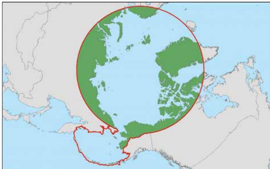
Map 4. Arctic Boundary as defined by the Arctic Research and Policy Act (ARPA). All United States and foreign territory north of the Arctic Circle and all United States territory north and west of the boundary formed by the Porcupine, Yukon, and Kuskokwim Rivers; all contiguous seas, including the Arctic Ocean and the Beaufort, Bering and Chukchi Seas; and the Aleutian chain. (Map Allison Gaylord, Nuna Technologies, May 27, 2009.)

Returning to our amphibious core competency and identifying where the next challenges are likely to occur is still an incomplete equation. The product of the answers to “who are we” and “where will we operate” must be the development of doctrine, equipment, and training to allow the Marine Corps to meet those future challenges. When it comes to doctrine, while the central concepts of amphibious operations are universal, the harsh and remote Arctic will require the development and refinement of tactics, techniques, and procedures to deal with a unique operating environment. Though the Arctic is warming, it is far