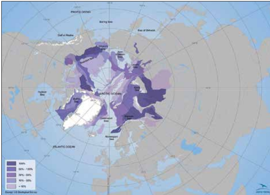
Map 1. The Arctic region.