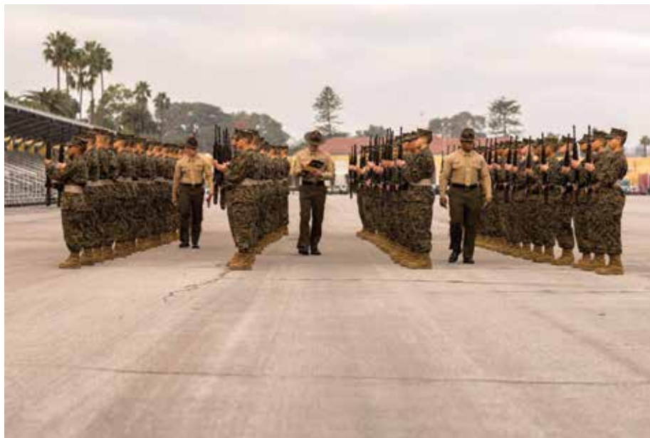
From here to MOS school and then the FMF. How will they be received at their new unit?

Fortunately, OBTE was supported by ongoing academic work, including the observation and analysis of the scientific community as it was conducted at Forts Benning, Jackson, and Bragg, as well as West Point. Yet, as we will see later, academic evidence and support was not sufficient to make OBTE a permanent Service-wide learning doctrine.