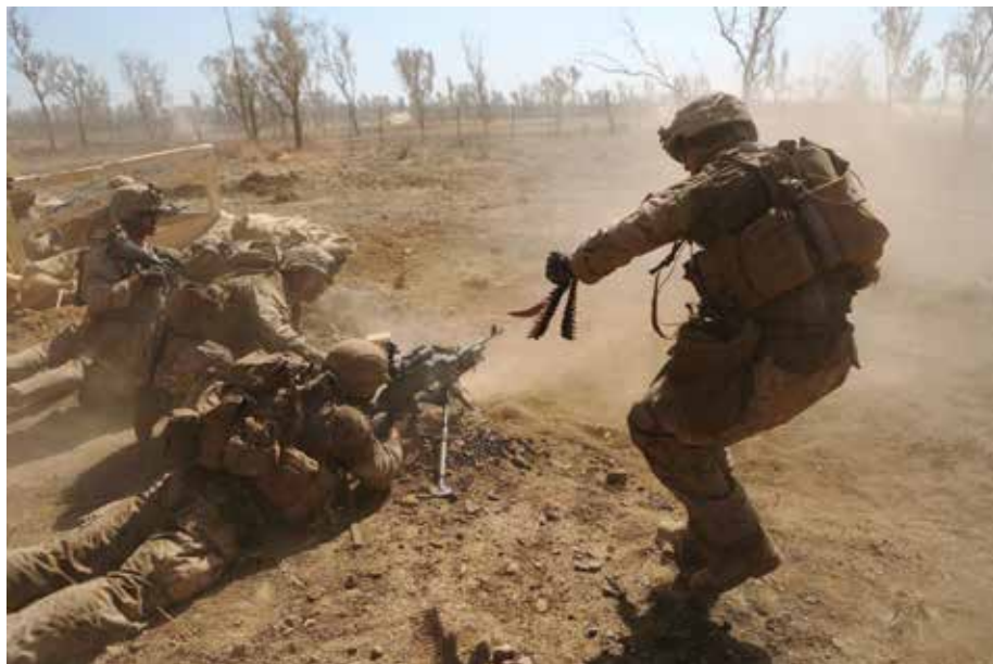
Physical strength is the hard work of our moral and mental self.

Warfighters consist of physical, mental, and moral forces. Moral strength can be cultivated, physical strength can be built, and mental strength can be developed. These forces, however, require constant investment; if ignored, they erode. Warfighters must seek self-awareness and work to maximize existing forces in order to become as knowledgeable, physically strong, and morally focused as possible.