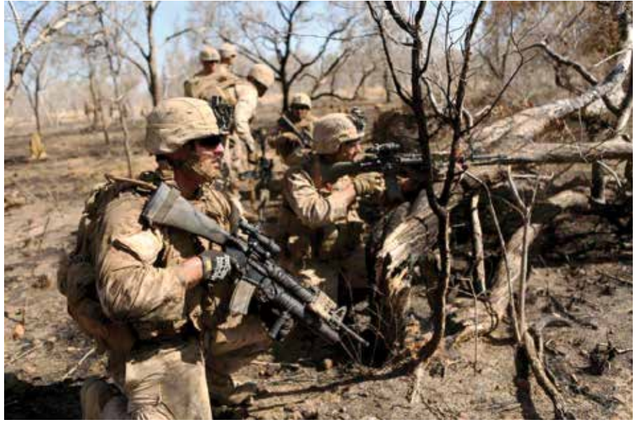
We train to the physical and mental preparedness for war.

Each warfighter uses different words to define their personal moral force. 16 A warfighter codifies it in writing, reflects upon it, and remains faithful to it. Our