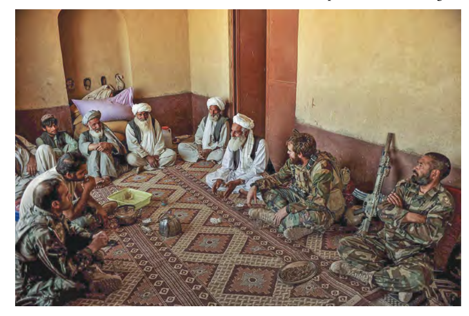
Marine Raiders act as connectors to joint, interagency, and allied partners.

Cognitive problem-solving capabilities, the ability to adapt and overcome, and a desire to win are some of the core strengths of Marines. The Marine Raider relies upon these core strengths