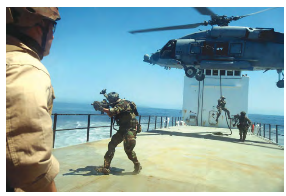
MARSOC Raiders leverage organic and joint force platforms and capabilities to provide effects on the multi-domain environment.

SOF will only benefit the joint force as a whole. This relationship with a strong foundation today will provide endless benefits for the future.