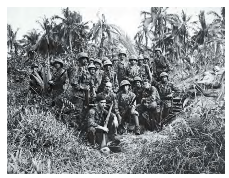
Marine Raider photo from WWII. MARSOCs lineage, unconventional force design and capabilities to support the joint force.

Given current capabilities, access, and placement, SOF can enable the joint force, geographic combatant commanders (ĞCČ), and the interagency in GPC activities. SOF and joint force placement are within areas of instability: areas where adversarial great powers seek to influence and undermine U.S. national interests. Within these areas of instability, SOF become a connector for the GCC and a facilitator for the joint force's movement into areas of instability. Additionally, SOF can enable the interagency through not only intelligence gathering but also as an effective and timely link to the joint force on the battlefield. Through three interconnected actions, connection, combined arms, and innovation, SOF can empower the joint force and