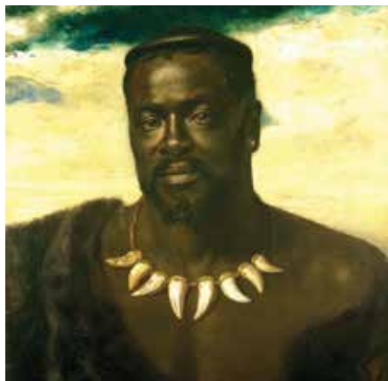
Cetshwayo, King of the Zulus (d. 1884). (Painting by Carl Rudolph Sohn, 1882.)