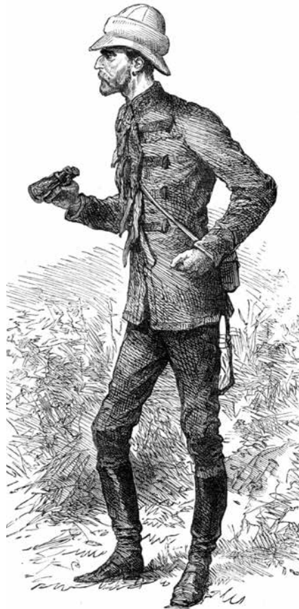
Sketch of Lord Chelmsford before the battle of Ulindi, July 1879.

Primarily, overconfidence and the seeking of a quick decisive battle can be very dangerous if commanders allow their own hubris to blind them to strategic considerations and ignore the fact the enemy may be maneuvering their own forces to spring their own trap. As the British found out, the separation of forces, in a vain attempt to find and destroy the Zulus, left their forces isolated and vulnerable to a Zulu leader who knew how to fight the English deep in his own territory. Secondly, planners must remember that over reliance on technology to win a battle or war can be fatal. Modern weapons will not defeat a seemingly inferior enemy unless properly employed and in conjunction with a combined arms force. Finally, strict adherence to regulations and rigidity in battle must sometimes give way as events unfold on the ground to allow troops to take their own initiative. For the British at Isandlwana, the failure to follow their own doctrine of preparing defensive positions overnight because the officers did not order it meant they were completely exposed. The rigidity of the ammunition distribution meant troops could not unleash their full volleys as rapidly as they should have.