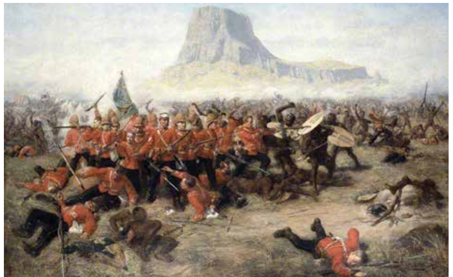
"The Battle of Isandlwana." (Painting by Charles Fripp, National Army Museum.)