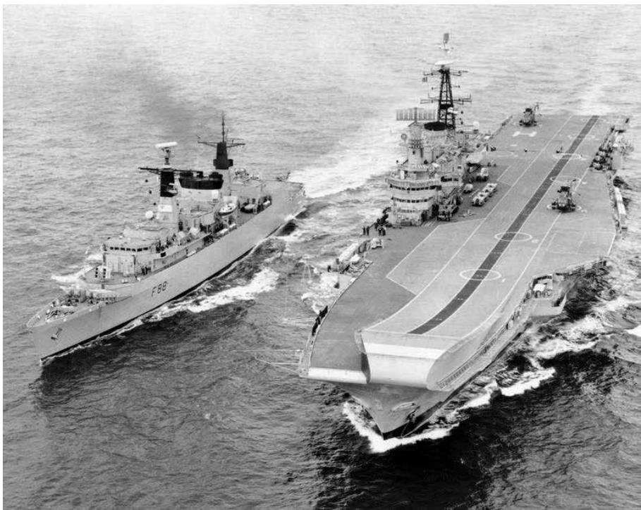
The Type 22 Frigate HMS Broadsword alongside HMS Hermes during the Falklands War, 1982.

In picking a landing site, planners selected Port San Carlos on the west coast of East Falkland Island because