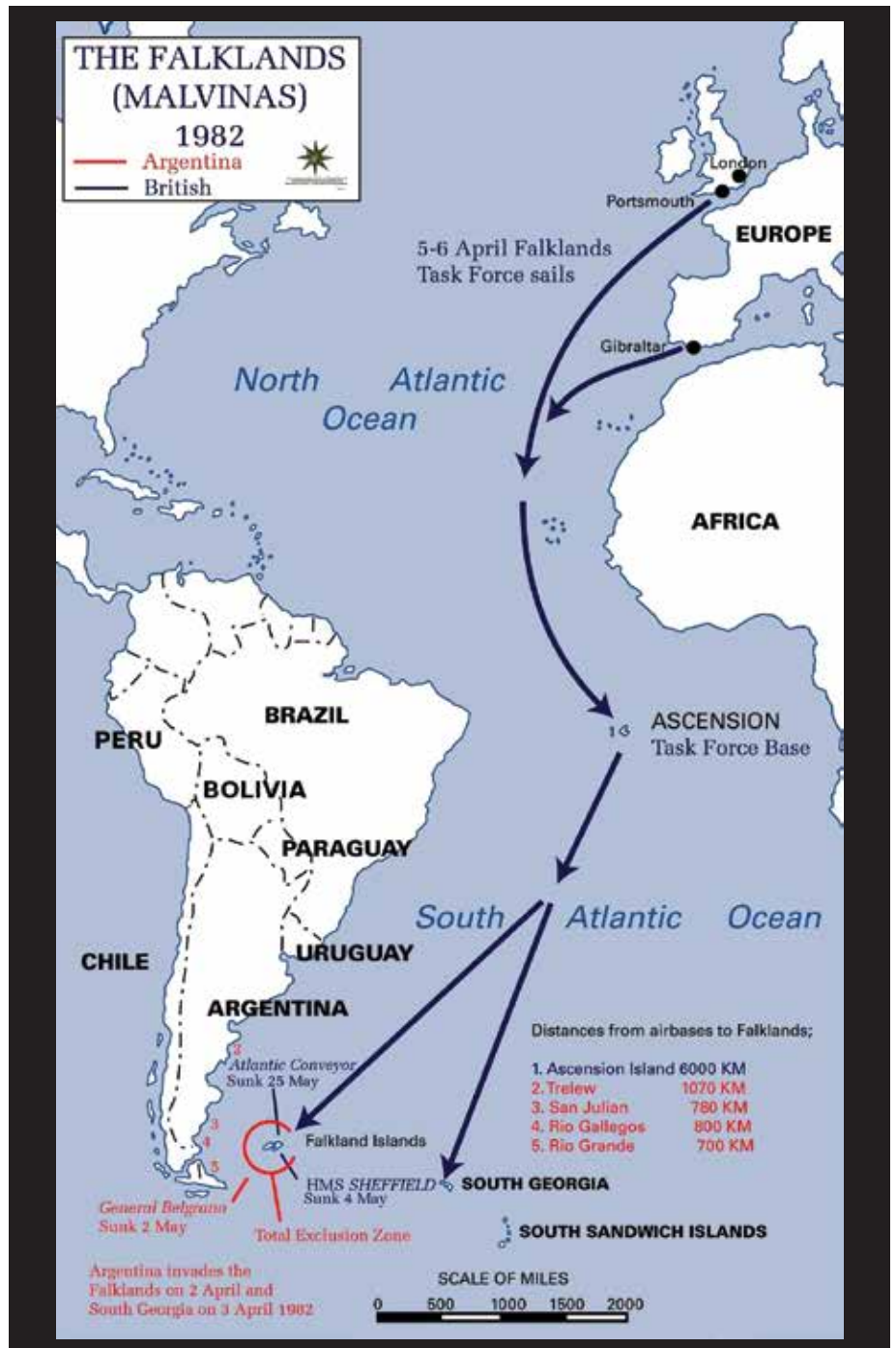
Map 1. The Falklands (Malvinas).

The British initially responded on 20 March to the action at South Georgia. The Royal Navy sent “a lightly armed patrol vessel, the HMS Endurance ” to that island “to remove the Argentinians, whoever they were.” 14 The government reinforced the Endurance nine days later by dispatching a