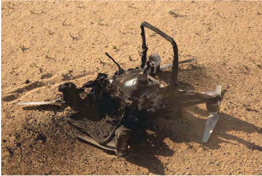
SUAS are likely to be encountered on future battlefields and we should be prepared to counter their effective employment by enemy forces.

unfriendly forces could retrofit, “giving the aircraft the ability to deliver weaponized explosives or hazardous materials.” 8