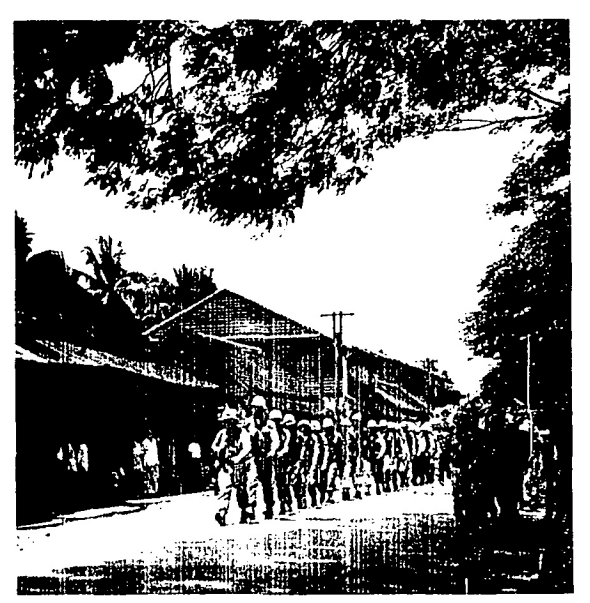
Citizens of Nong Hong, Thailand watch 3d MEB's 3/9 returning from field exercises.

The Air Force can't operate their big jet bombers from grass and dirt airfields, and Greece raised objec-