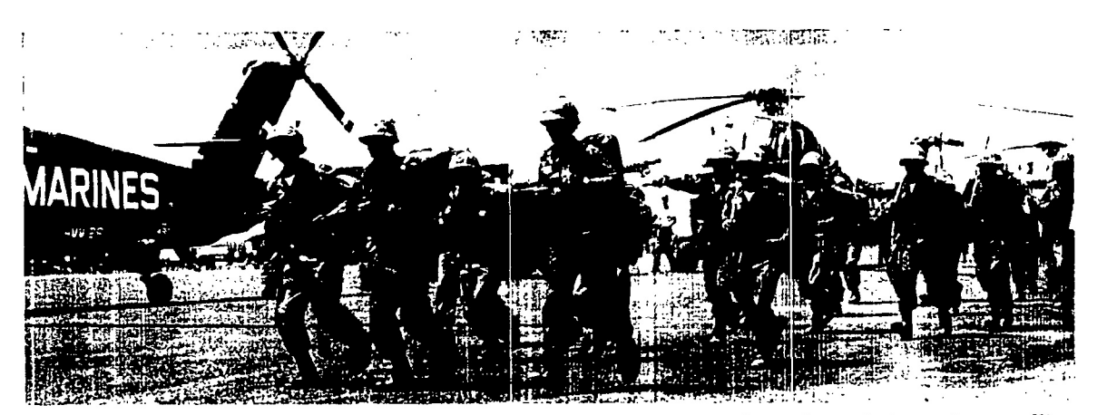
Military missions like this Marine helilift for Thai soldiers build pride and patriotism of our allies. 36

The stabilizing process is effected partly by economic assistance, helped by military missions. Economic and financial assistance helps these states in their fight against poverty, a recognized seed bed for Communism. The military missions, by training and furnishing