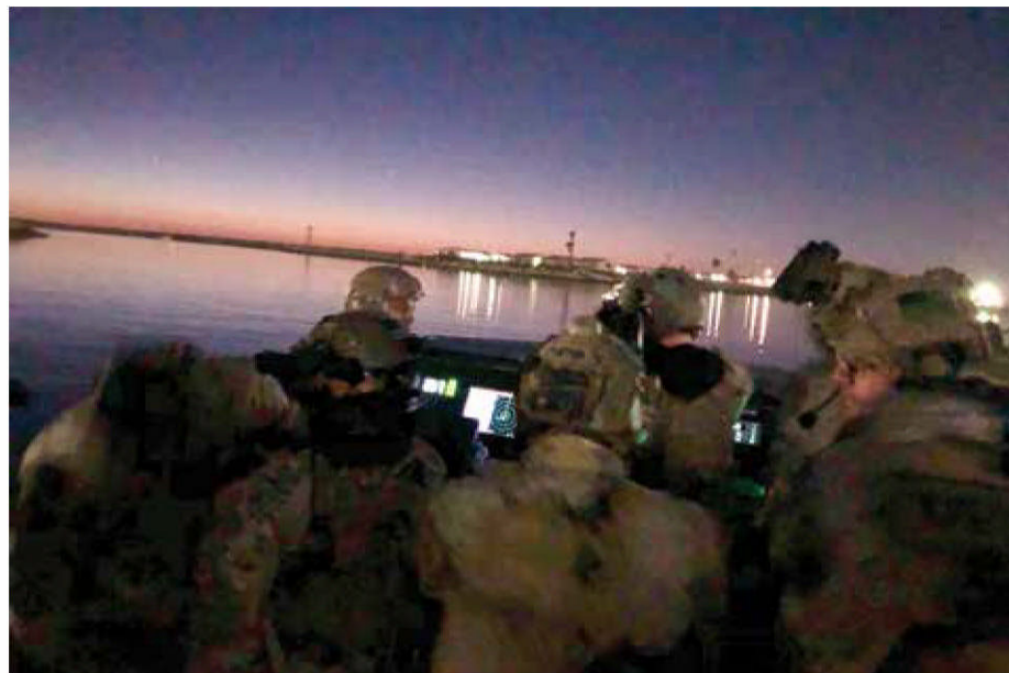
MARSOC element maneuvers within littoral critical infrastructure.