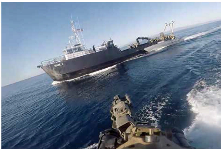
MARSOC elements approach a non-standard vessel while operating in the littorals.

diverse set of nonstate actors engaged in hybrid warfare. Operating in and around them will require investing in local and U.S. intergovernmental relationships to create a wider network of information sources and reliable partners during a crisis.