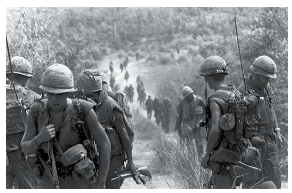
In the late 1970s and early 1980s, many wanted to put the Vietnam experience behind them and revert to concepts of conventional warfare.

intended to provide vicarious learning experiences that enabled Marines more readily to recognize patterns and identify solutions to problems they encountered on the battlefield. This is necessary to enable the effective use of technology.