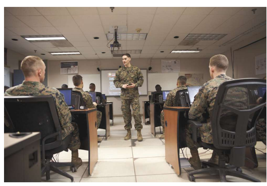
Today, the Marine Corps' culture of learning strives to develop Marines' critical thinking and decision-making skills.

Today, the Corps faces a similar crossroads, once again trying to modernize as it enters another great power competition following an even longer period of combat. Iran and its terrorist proxies remain a destabilizing influence, the novel coronavirus has disrupted