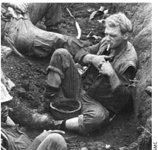
Marines and journalists wait in the safety of a trench beside Con Thien's landing zone until the arrival and touchdown of the helicopter that will take them from the base back to Dong Ha on Oct. 2.

This concept is trained and instilled in the minds of Marines. This is a legacy. It's our legacy. It provokes motivation, humility and a sense of understanding about why Marines do what they do. It isn't just a sense of responsibility or duty that compels us to perform courageous acts, but a desire to protect and surrender ourselves to each other. We do this because we are a hive, a single entity composed of many different men and women. We're not individuals, but a unit. In that, our legacy is secured, and if we embrace our training, values and heritage, instead of living a prison sentence, we're living an honor.