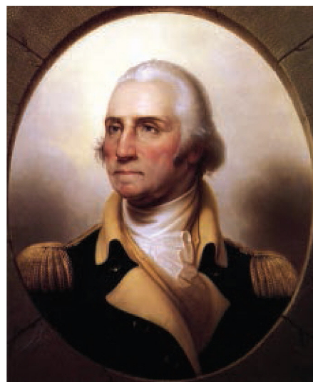
GEN George Washington.

Surprise. The deception campaign was a critical element essential to the successful outcome of the operation. "By dispersing the French and American armies on multiple routes, the allies maintained the ruse that they were massing for an assault on New York." 7 This forced Clinton to keep his forces in New York and kept him guessing as long as possible on the Colonials ultimate destination. The Colonial Army made a feint toward Staten Island and then moved south to meet with transport ships at the headwaters of the Chesapeake Bay, for further movement