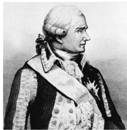
LTG Rochambeau.