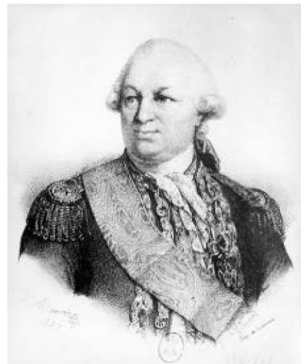
ADM De Grasse.

Leverage. Washington leveraged all available advantages he could muster, notably the asymmetrical actions of the southern militias and the naval power of the French. Under the command of GEN Nathanael Greene, the asymmetrical actions used by southern forces were hit-and-run and delaying tactics. These tactics were a constant drain on