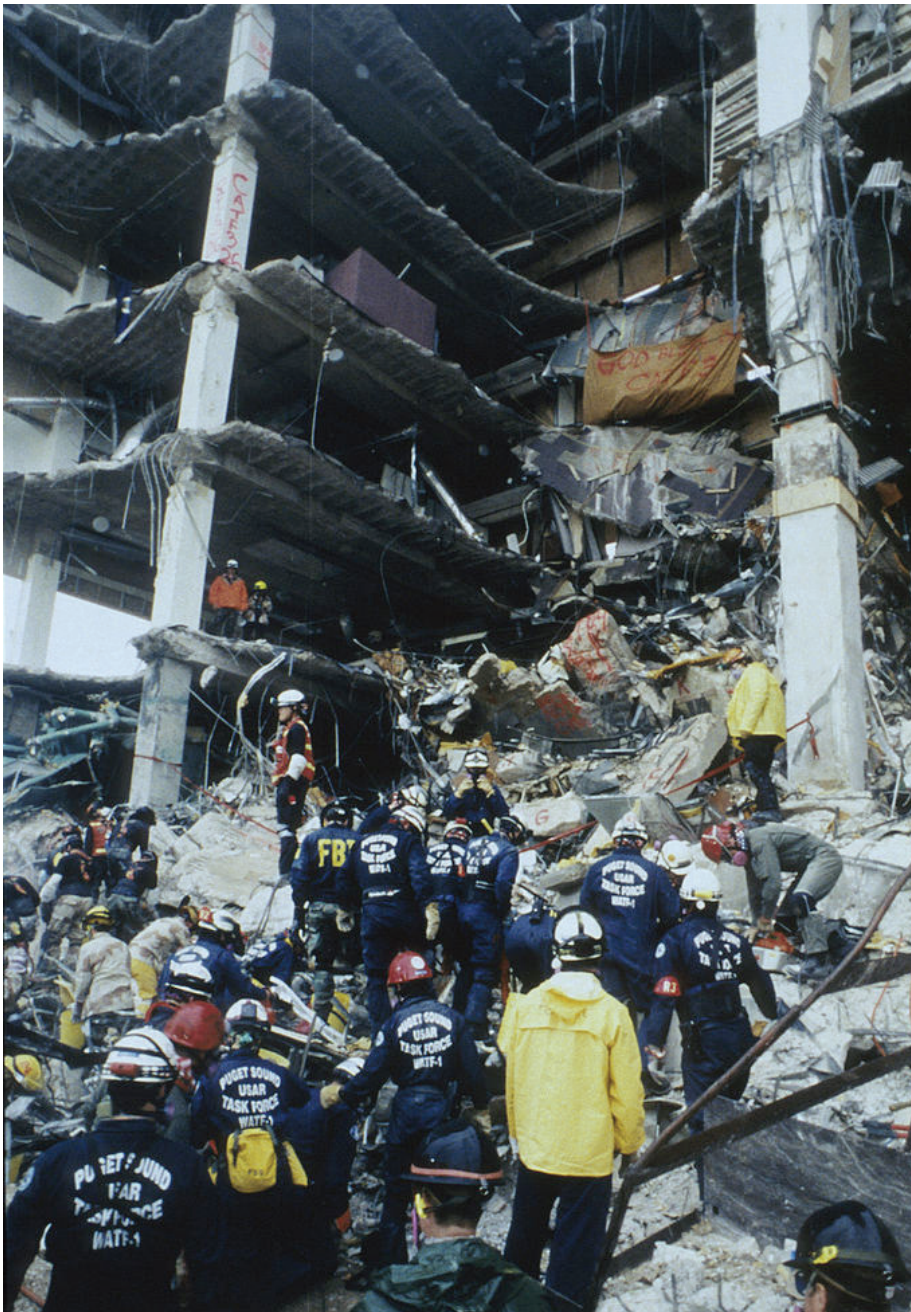
Search-and-rescue workers gather at the scene of the Oklahoma City bombing on April 26, 1995. It took many days and a great deal of manpower to recover all the bodies from the rubble.