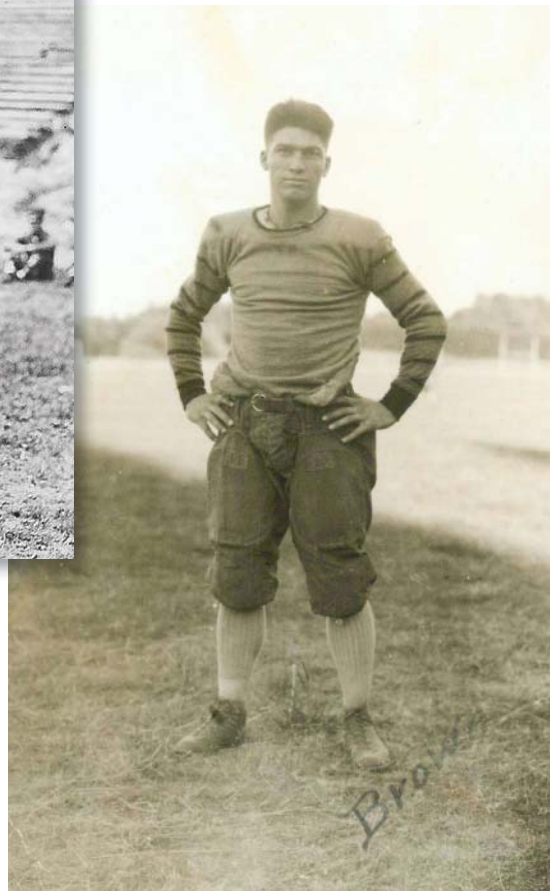
Below: MajGen Smedley D. Butler was instrumental in the growth of the Marine football program in the 1920s. The stadium at Quantico bears his name.