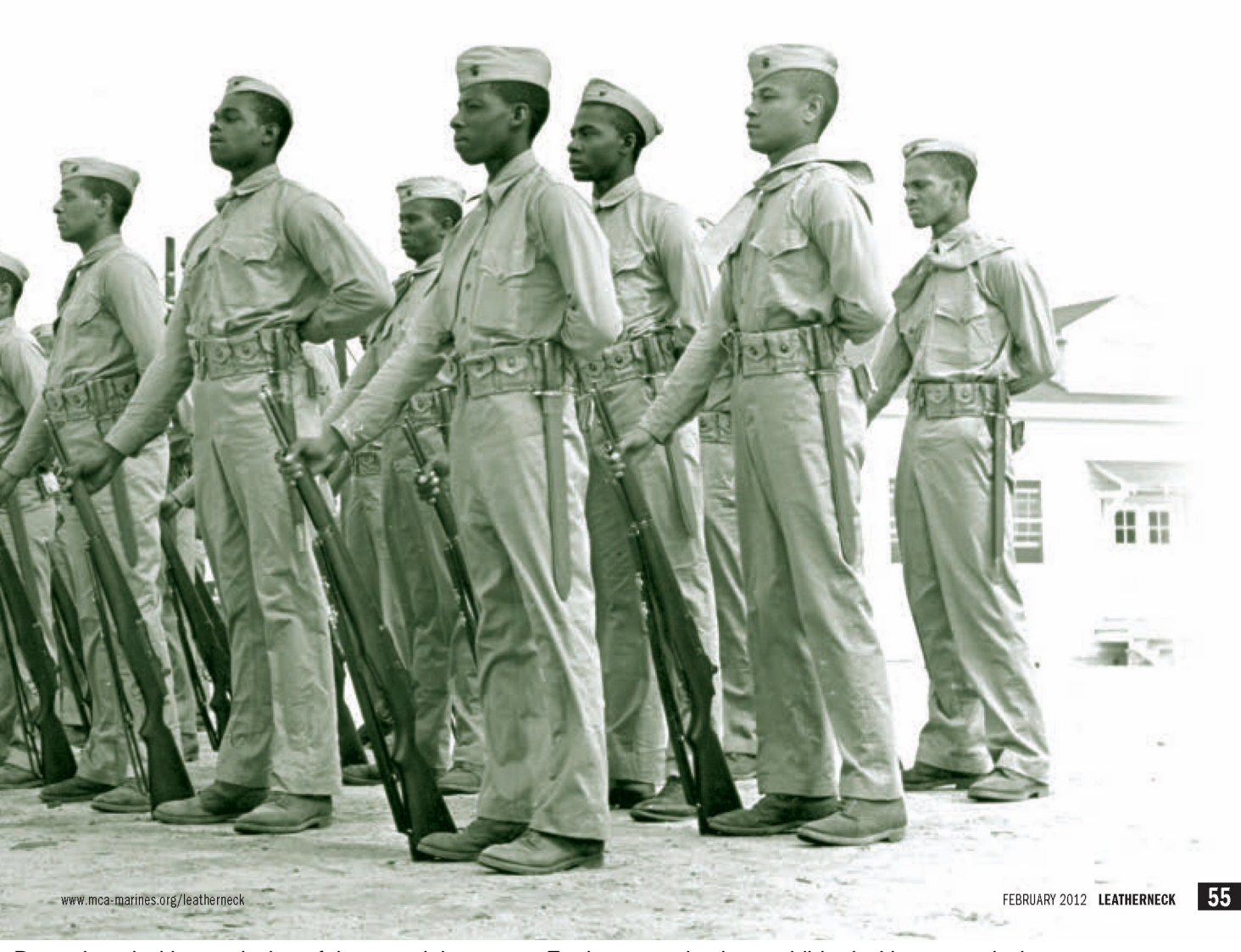
Reproduced with permission of the copyright owner. Further reproduction prohibited without permission.

Black Marine recruits fall out for inspection at Montford Point, New River, N.C.