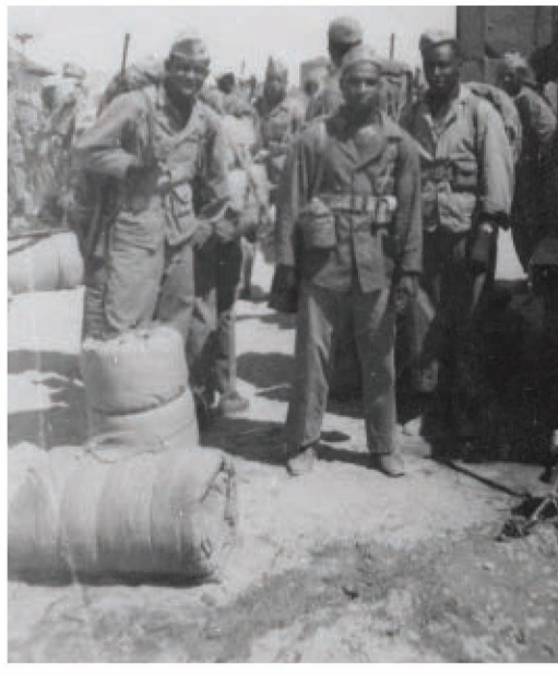
The training at Montford Point served the Marines and the Corps well in the Pacific campaigns of WW II.

Perceptions of ethnicity in the Marine Corps during WW II also changed. Interspersed among white units, Marines of