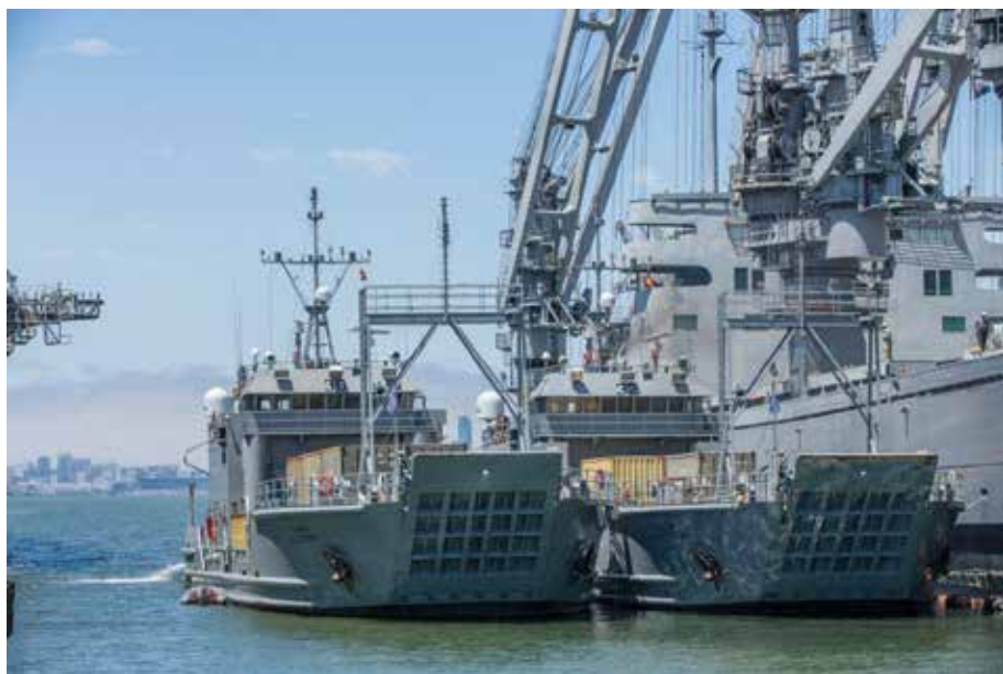
LCU tied up along-side MSC ship.

LCUs are also ideal platforms for providing fast and effective support during humanitarian aid or disaster relief (HA/DR) missions, thereby strengthening relationships with partnered nations. These ships could continue to provide support to large-scale maritime prepositioning force offloads as they already do while also enabling small-scale offloads during which they only take the necessary equipment for a particular mission. Reutilized Army LCUs will provide the Marine Corps with a single-infrastructure multiple-application platform that could be reconfigured to meet individual mission requirements.