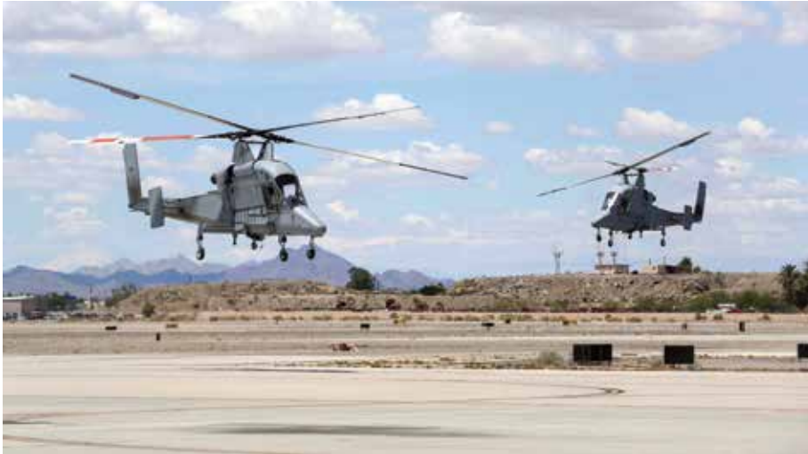
The K-MAX at Miramar.

risk, high-reward aerial delivery options to mini-MAGTFs, and there is already a Marine Corps veteran aircraft perfect for this role.