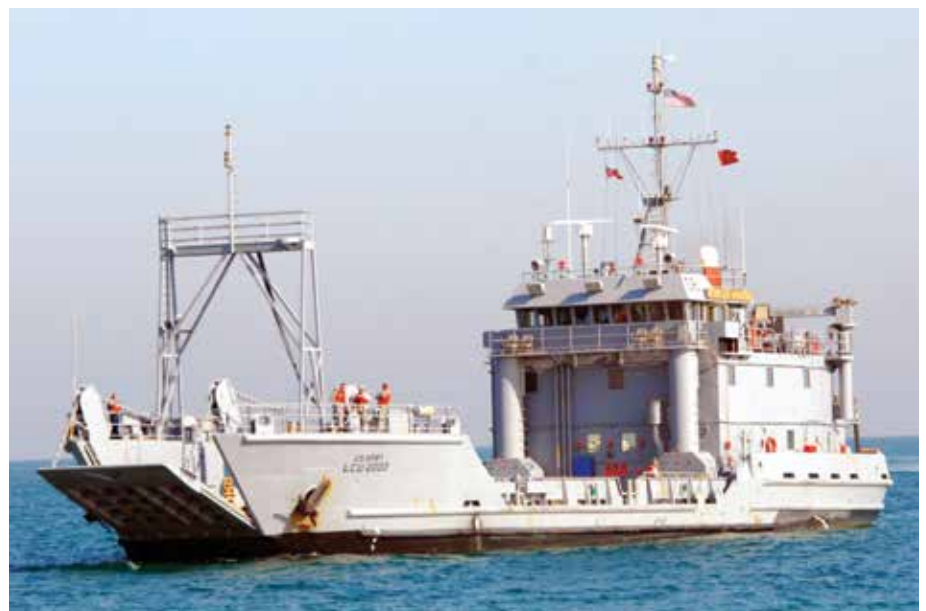
The LCU Kennesaw Mountain.

The Army’s current Landing Craft, Utility (LCU) is a well-designed and capable vessel. It is a versatile, 174-foot roll-on roll-off (RORO) platform with a low draft and a forward ramp capable of carrying up to 500 tons of cargo. To put that into perspective, a single LCU could carry the equivalent of eight C-17 loads, five M1 tanks, or twenty-four 20-foot ISO containers. Just one of these vessels could sustain a combat-credible force dispersed throughout the “contact layer” almost indefinitely. It is capable of being transported on the decks of larger ships for inter-theater transportation, but it is also rated to U.S. Coast Guard standards for full ocean service. The Army LCU requires only a 13-person crew and has a maximum range of over 10,000 miles. 12 Best of all, the Army does not want them! According to the maritime website, Captain.com, “At least 18 of [the Army’s] 35 Landing Craft Utility (LCU) will be sold off or transferred to the Defense Reutilization and Marketing Office (DRMO).” 13 The fact that we could potentially get these LCUs for free from DRMO is all the more reason to try out the concept of Marine mariners. While this concept will take time to be vetted through the