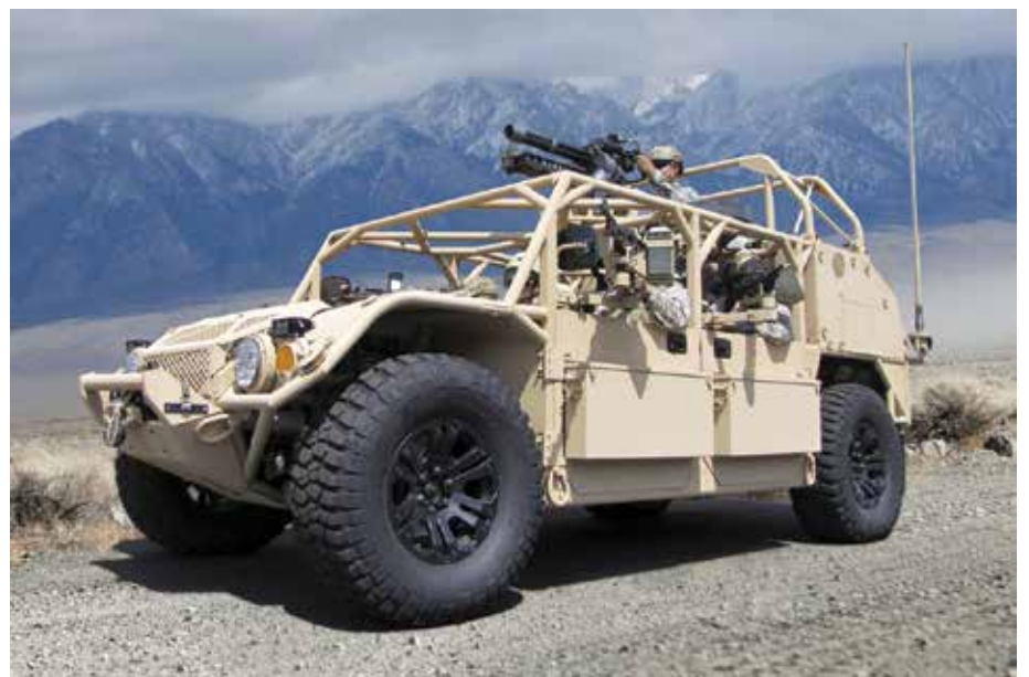
The ground mobility vehicle.

The recently acquired Joint Light Tactical Vehicle is not the answer to the transportation needs of a mini-MAGTF. The JLTV, costing almost a half million dollars each, is too heavy,