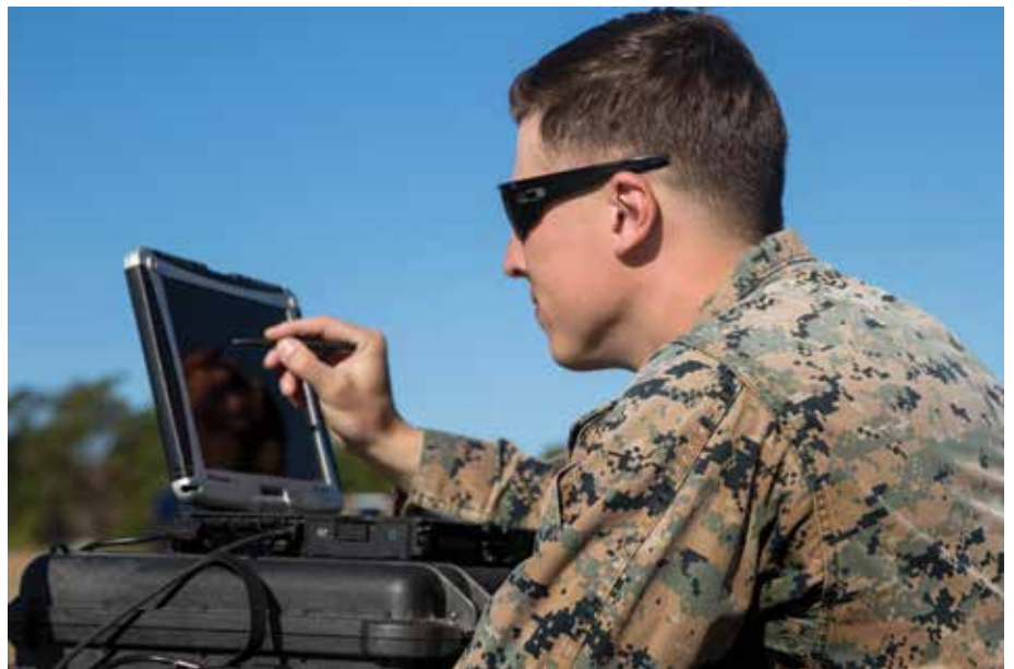
Marines exercise the employment of small unmanned aircraft systems to ensure familiarity with the systems capabilities/limitations.

The events surrounding the United States' involvement in Somalia and, more specifically, in the capital city of Mogadishu in 1991–1994, were examples of what so many recent military documents claim will be the future of warfare for the United States. The U.S. military conducted operations in a dense urban center along the littorals rife with civil war, among an impoverished population whose central government had collapsed and been replaced by warring non-state actors, and against fighters with arms and equipment originally from top-tier militaries. An additional similarity seen in Mogadishu that will be present in the future was an obser-