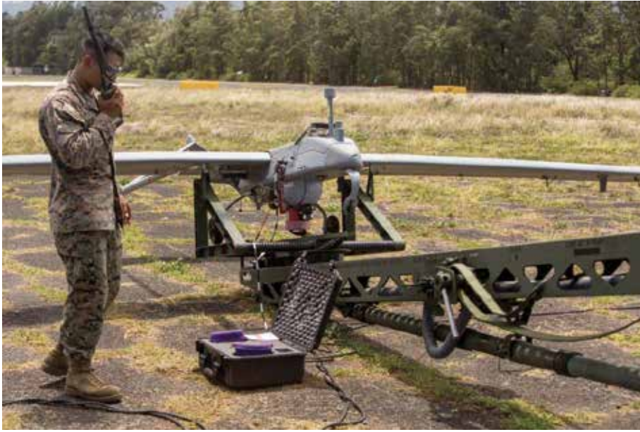
Unmanned systems will play a larger role in future operations.

and delayed rescue attempts by several hours. Then, following the firefights, General Aideded took full advantage of his control over Radio Mogadishu to proclaim the firefights as a victory of the Somali people against unjustified attacks by UNOSOM II forces against peaceful civilians. 32 Violence and offensive operations escalated quite quickly in the following days and weeks.