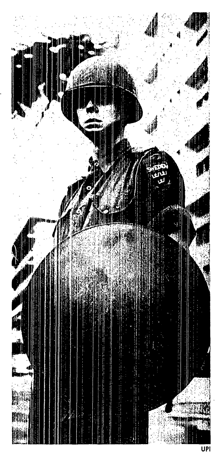
Swedish soldiers with UN forces in the Congo used primitive but practical armor-shields and clubs

Firepower is not the answer in the war of the two ideologies. Wordpower incites the mobs who win all the battles in "Polwar"