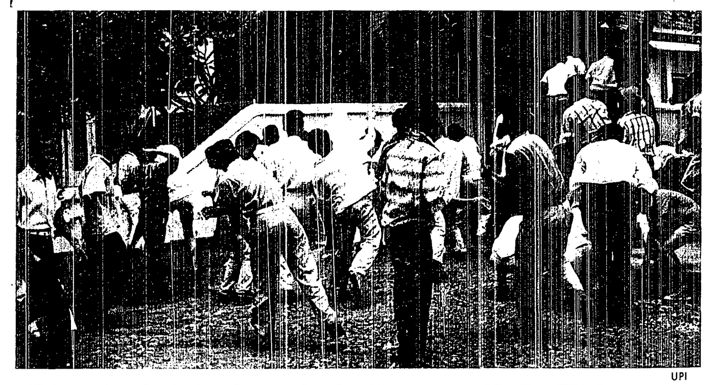
Mob action has played a big role in overthrowing eight governments friendly to US in last two years 24

The cold-war activities of nonmilitary agencies—"foreign aid," "truth (or information) campaigns," "student (or cultural) exchange," even much of the clandestine