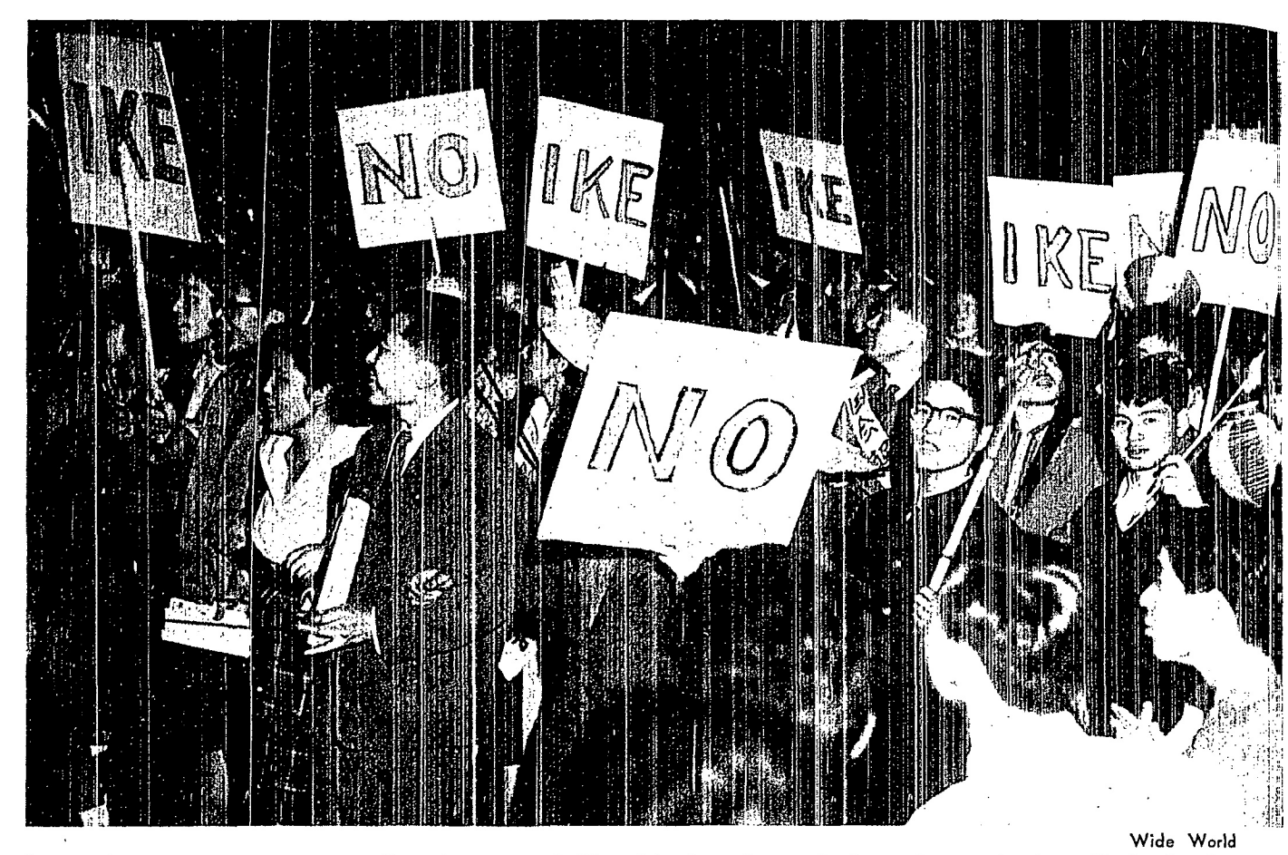
Expensive weapons are no good against a mob like this, but the mobs have been winning all the battles

quests since 1917, seizing eastern Europe, with 100 million inhabitants, and mainland China, with 600 million.