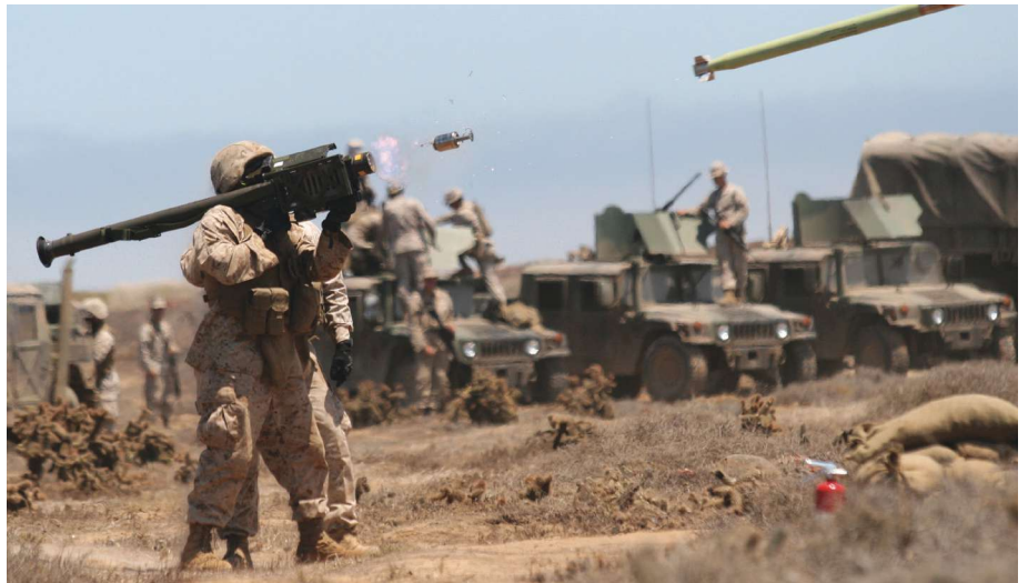
The Stinger missile was an inexpensive weapon that proved its worth.