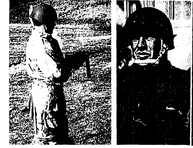
Italian soldier with Beretta SMG

Turkey-in-Asia is a much larger problem. The Black Sea coast and the common border with Russia far to the east stretch for more than 1,000 miles. But it's essentially the same type of terrain. Defending a beach under modern concentrations of bombs, missiles, rockets, and artillery projectiles may be next to impossible. Behind the coast, however, there are mountains as rugged as those close to Bulgaria. To the east, the Russian border country is wild and desolate. The Turkish army would hold this long front with the type of forces most appropriate to local terrain and the composition of Bloc forces attacking. Turkish armor and heavy artillery are adequate