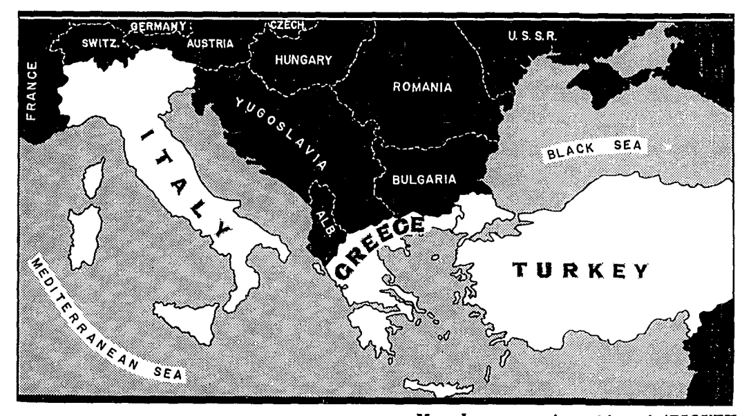
Map shows strategic position of AFSOUTH nations in relation to Soviet bloc