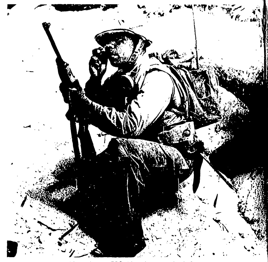
Over 400 of the 520 Navajos recruited for communications work became code talkers. Some became scouts and snipers