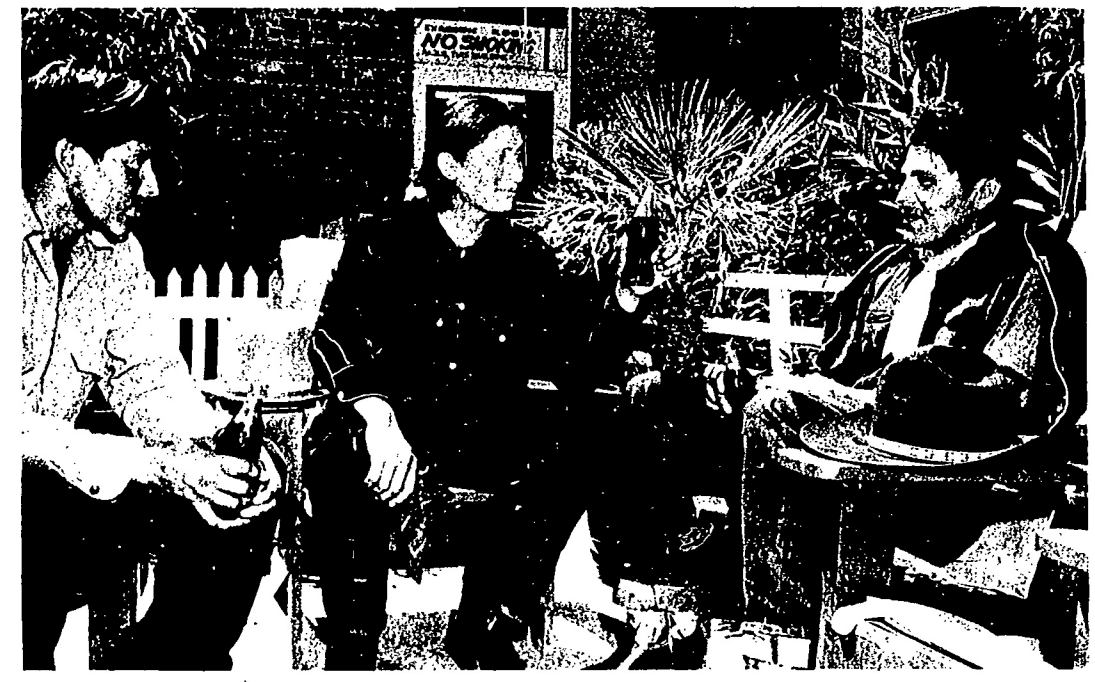
Indians from remote areas on Arizona reservations lost no time reaching the nearest induction center. These three braves appeared in full regalia. Some came armed and ready to do battle

The Japanese developed an uncanny facility for