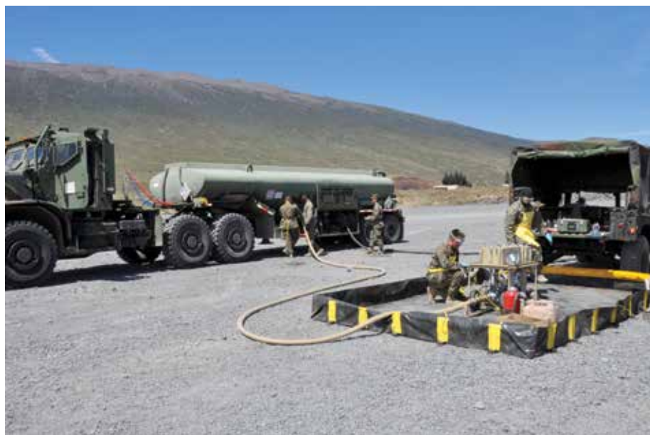
Marines and Soldiers additize fuel in a tank truck at Pohakuloa Training Area, HI, using the Marine Corps expeditionary mobile fuel additization capability prototype system during the RIM of the PACIFIC Exercise, 18 July 2018.