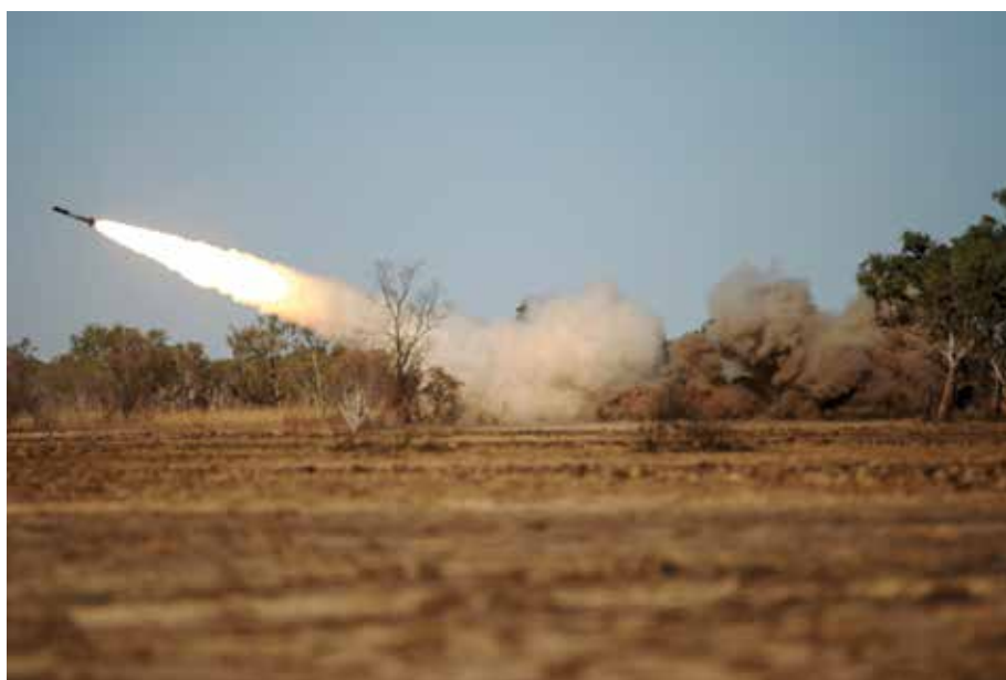
HIMARS provides long-range surface fires.

systems are worthy of study and discussion, these topics are not the focus of this article.