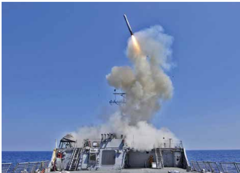
Marines will develop new methods of employing Navy fire support assets.

Marine fire supporters should be permanently assigned within the fleet N-3 section. This would have the most immediate positive impact on MOC fires cell capabilities. In contrast to many Navy officers who may only have a brief exposure to fire support, many Marines practice and refine this discipline for their entire career. By the time a Marine artillery officer, air officer, or fire support chief reaches a point where they may be assigned to an operational-level staff, not only have they attended the same schools required of the MOC fires