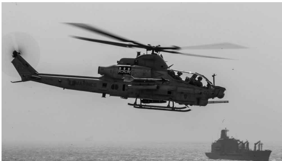
Marine aviation assets can provide armed escort in defense of the fleet.

A second military problem identified within Littoral Operations in a Contested Environment is the differing warfighting constructs between the fleet and Marine Corps. Many Marines do not understand—or have not prescribed to—the Navy's composite warfare commander (CWC) construct. Under CWC differ-