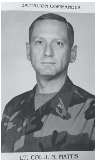
When he was a lieutenant colonel, Mattis commanded 1st Bn, 7th Marines during Operation Desert Storm.

“The kind of a unit that needs ‘Mother, may I,’ doesn’t delegate responsibility because they don’t trust that their troops are disciplined enough or effective enough on their own to make good decisions—those units will become basically irrelevant.”