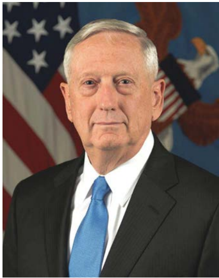
James N. Mattis served as the 26th Secretary of Defense from January 2017 to December 2018.

As high as his expectations are for those lieutenants, Gen Mattis' tolerance of mistakes from young Marines may be somewhat of a surprise. "You're tolerant of mistakes but absolutely intolerant of a lack of discipline."