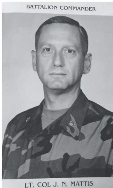
When he was a lieutenant colonel, Mattis commanded 1st Bn, 7th Marines during Operation Desert Storm.

“The kind of a unit that needs ‘Mother, may I,’ doesn’t delegate responsibility because they don’t trust that their troops are disciplined enough or effective enough on their own to make good decisions—those units will become basically irrelevant.”