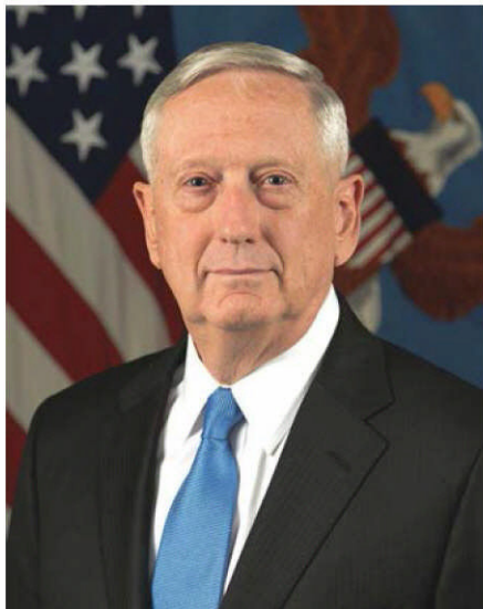
James N. Mattis served as the 26th Secretary of Defense from January 2017 to December 2018.

As high as his expectations are for those lieutenants, Gen Mattis' tolerance of mistakes from young Marines may be somewhat of a surprise. "You're tolerant of mistakes but absolutely intolerant of a lack of discipline."