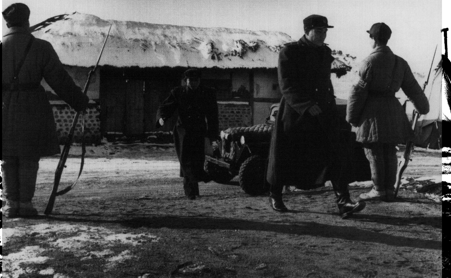
Men continued to die and the Korean War bogged down in the trenches while United Nations and communist Chinese and North Korean delegates negotiated in Panmunjom.