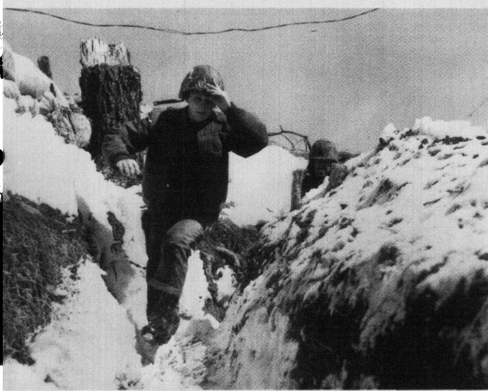
Marine mortarmen raced to get their tubes into action as incoming mortar fire shifted. A communist infantry assault usually was not far behind the shifted fires.

Far off in Washington the decision was made that tactical actions in Korea would conform to the new strategic objective of maintaining the territorial integrity of South Korea. From Washington to theater headquarters in Tokyo to Eighth Army headquarters in Korea the orders flowed. All offensive operations aimed at gaining further ground were to be halted. Only limited local operations in nothing larger than battalion strength were to be undertaken. The Eighth Army was to assume a defensive posture. GEN Van Fleet's order to this effect was issued on 20 Sept. It was on this date that the war in Korea ceased to be a war of movement and became a war of position.