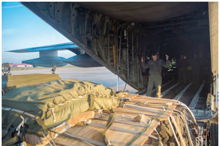
Our intent is to provide support to sustain our forces.

Significant change to the logistics enterprise must begin immediately to support this reorientation and continuously ensure the lethality of the MAGTF. This headquarters is already busy innovating and developing new ways to modernize a rapidly aging logistics enterprise, using guidance such as the hybrid logistics vision and the still developing expeditionary advance based operations (EABO) concept as points of reference. The Next Generation Logistics (NexLog) team continues to