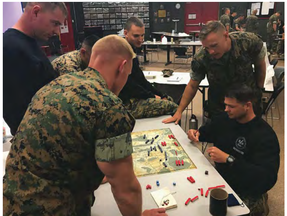
Participants should have an understanding of the learning process.

Designed with a constructivist lens to adult learning, each exercise and assignment in the IIW purposefully places participants in their own contexts to capitalize on prior experiences. 14 This design reinforces the acquisition of new knowledge and allows participants to explore their new roles, relationships, and actions—as both learners and facil-