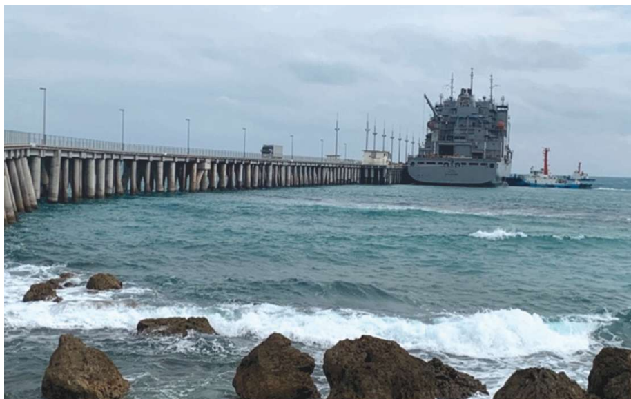
The complexities of competitive advantage in action. This photograph was taken at Tengan Pier in Okinawa, Japan, immediately prior to an offload of ammunition. Value Chains for ammunition are highly complex. As an example, Javelin anti-tank missile components are developed around the world, assembled in the United States, and delivered through multiple ports of entry prior to the photographed ship being pushed into its moor by highly skilled Japanese tugboat operators.

Although "competition" is not a clearly defined military task, as stressed within Competing , it is both fundamental to the human condition and ever-present in international affairs. For these reasons, naval expeditionary forces play a vital role in competition among nation-states, and like every element of the joint force, can trace their competitive contributions back to defending our nation's homeland, assuring our allies, and detering potential adversaries from taking actions that threaten shared inter-