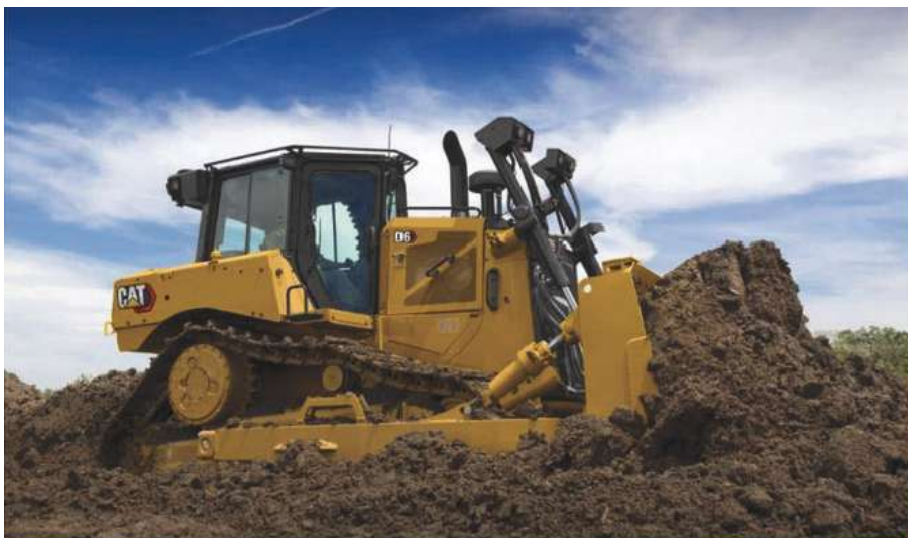
Cat® D6 ブルドーザ

During the class IX market research, an observation is that commercial engineer equipment equivalents for some vehicles deployed from Okinawa to Camp Fuji were available at the Caterpillar