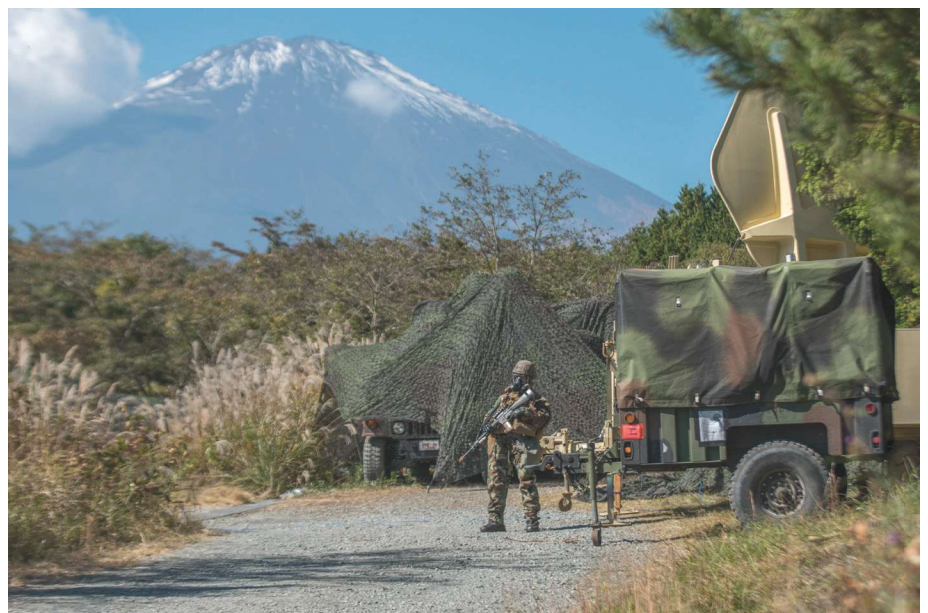
21st century foraging as part of training at Camp Fuji.