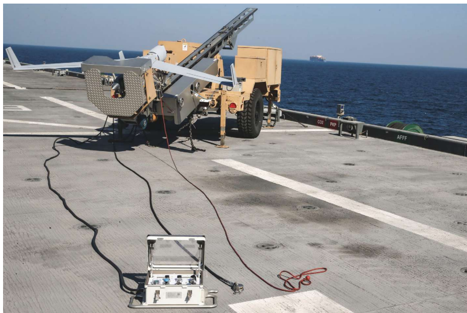
Intelligence gathering and reconnaissance missions in the Indo-Pac theater will have to increase as China exerts its influence and military presence in the region.