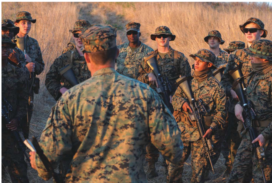
The refrain “train, train, and train some more” will be heard repeatedly.

deployed MAGTFs to synchronize effectively in coordination with inter-agency partners in order to expose PRC propaganda and misinformation. The end state of such an approach is to ensure the United States emerges as the key partner of choice while undermining PRC malign influence.