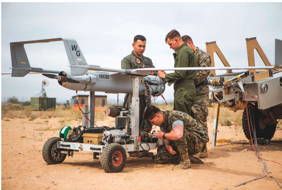
Marines with Marine Unmanned Aerial Vehicle Squadron One prepare to launch an RQ-21A Blackjack UAS in support of Weapons and Tactics Instructor course 2-19 at Canon Air Defense Complex in Yuma, AZ.

Logistics Agency Aviation, etc. The business acumen accumulated during these tours is immensely valuable for acquisition officer duty; similar acumen could be augmented with later service in a traditional aviation program office. By exposing 6002 and 6602 qualified officers to acquisition billets early in their careers, they would act as prime