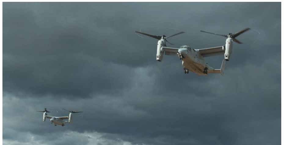
MV-22s with Marine Medium Tiltrotor Squadron 265 (reinforced), assigned to the 31st MEU delivers equipment to Marines with BLT, 1st Battalion, 5th Marines, near Kagoshima, Japan.

In order to best support the Commandant's future vision of Force Design 2030 , the Marine Corps must strategically right-size the 8059 MOS population. First, the Marine Corps should immediately increase 8059 structure to cover all present aviation acquisition billet requirements. This enables the 8059 community to avoid gapping billets and plan for selecting consistent and predictable 8059 accession peer groups. Though it may take two years to transi-