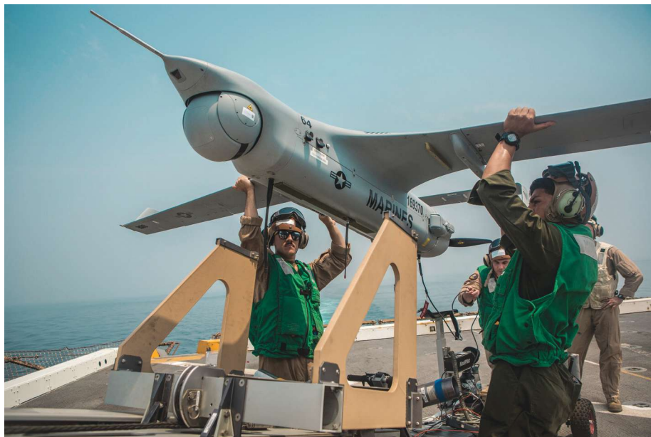
Marines with Marine Medium Tiltrotor Squadron 163 (Reinforced), 11th MEU lift an RQ-21A Blackjack UAS onto a launcher before flight operations aboard the amphibious transport dock ship USS John P. Murtha (LPD 26).

The Marine Corps should consider adopting a similar accession model for aviation acquisition management professionals, creating new entry points into the 8059 field for 6002 and 6602 MOS qualified officers. Similar to the revised early onboarding career model proposed for 8059 development, 6002 and 6602 Marines could serve in acquisition billets post first fleet tour, accruing program office type of acquisition billet time and experience; this would enable them to more effectively understand and navigate the Marine Corps aviation