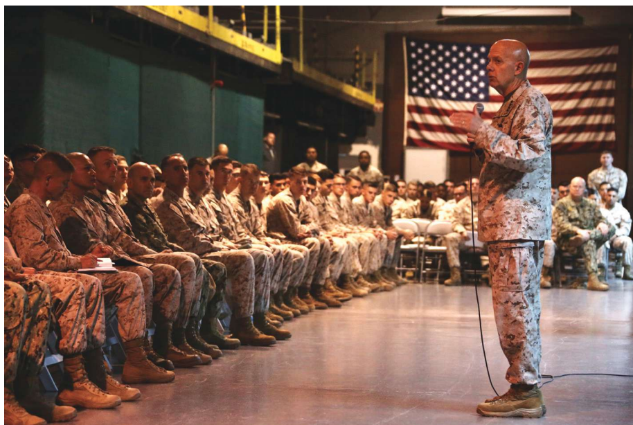
Gen David H. Berger, Commandant of the Marine Corps, speaks to Marines and Sailors during a town hall while visiting Bahrain.

tion enough 8059s to source and staff the new structure requirements, the change sets the initial conditions to achieve depth in personnel; without this action, depth may go perpetually unrealized. Second, the Marine Corps should add new 8059 structure now to support emerging Force Design 2030 program management requirements. This enables the Marine Corps to capture 8059 talent now, affording time to develop and mature appropriately to adequately fill critical program management leadership billets associated with heavy UAS development and procurement efforts scheduled early in this decade. This action also prevents a repeat of history, where 8059 structure fails to cover transitioning and emerging billet requirements. Finally, the Marine Corps should ensure enough structure exists to rotate 8059s into PME assignments without causing staffing gaps at traditional program office sites. Presently, the 75XX community often fails to send talented officers to Service schools and exchange tours because of poor MOS depth, rightfully prioritizing fills to operational billets over shore opportunities. This reactive-staffing policy stunts professional growth, reduces career competitiveness, and negatively impacts