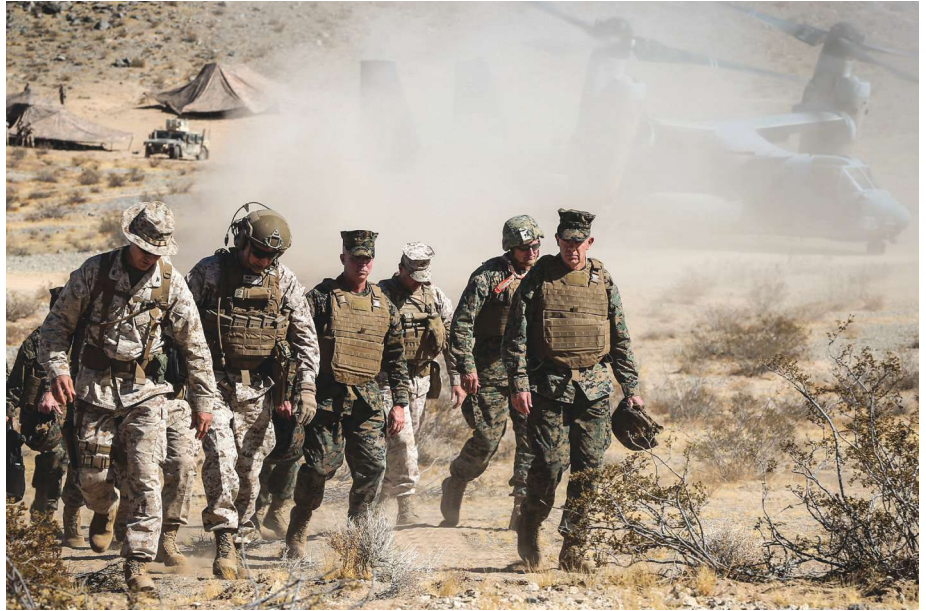
The Commandant and members of the 2dMarDiv and MAGTF-TC staff land in an MV-22 Osprey at Marine Corps Air-Ground Combat Center, Twentynine Palms, CA.