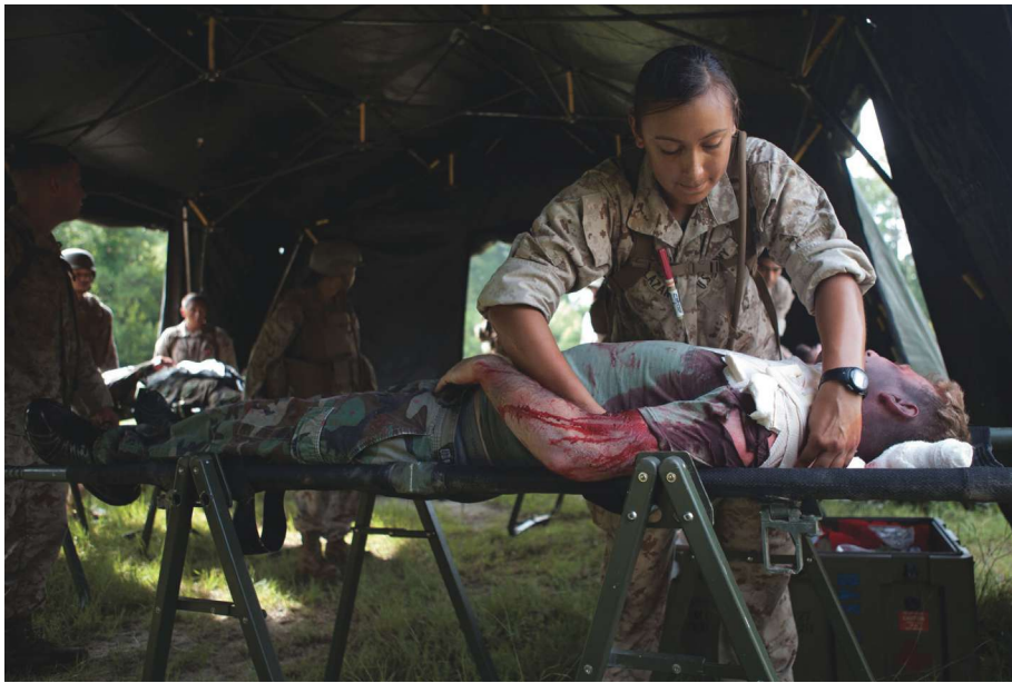
Corpsmen receive extensive training at the Field Medical Training Battalion.

for a MedCOP that will enhance the ability of FMF corpsmen to optimize battlefield care and transport, even in contested conditions.