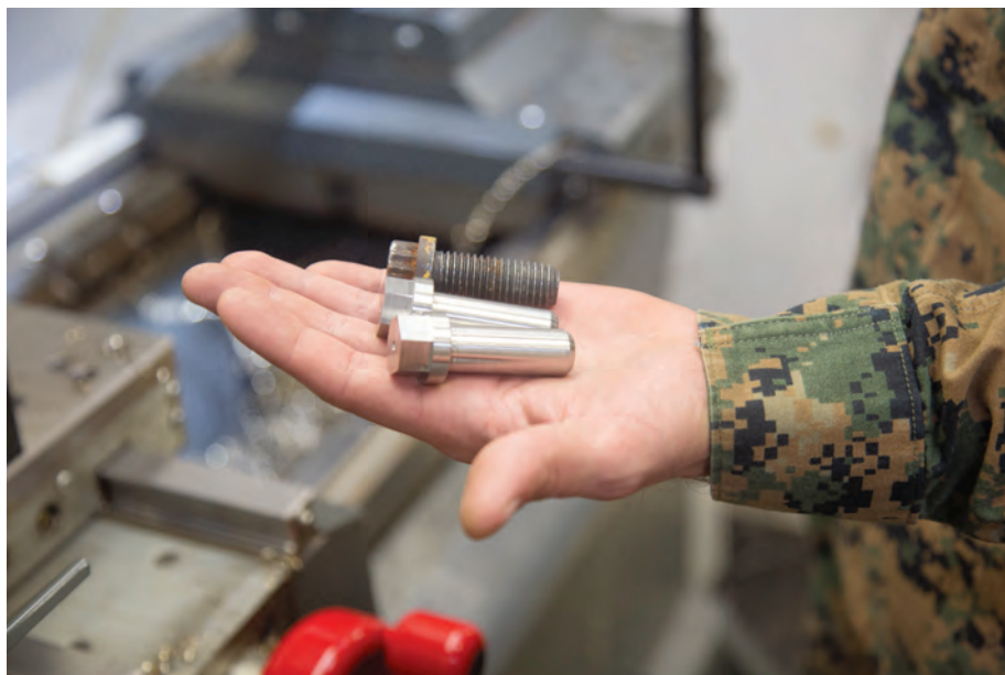
Additive manufacturing and 3D printing allow Marines to make replacement hardware at their duty station or while deployed.

MOES is leading innovation in the explosive ordnance disposal realm and