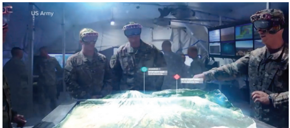
Figure 4. Soldiers performing mission planning with IVAS.

Recently, the OT authorities have been expanded by Congress, and the DOD has responded with an increased use of OTAs for research, prototyping, and production. There are three types of OTs that can be used by the DOD. Research OTs are used for basic, applied, or advanced research programs for dual use technology. This type of OT requires a 50/50 split on the cost of the program between the government and the civilian organization. Research OTs do not allow for follow-on production or transitions. Prototype OTs are appropriate for research and development and prototyping efforts that advance effectiveness of the military mission. Though the Prototype OT can only be used to develop limited numbers of prototypes, it can allow the non-governmental party a route to be awarded a follow-on production contract without having to re-compete against other companies for the award. 11 It is important to understand that for a company to be awarded a follow-on, non-competitive production contract, the Prototype OT solicitation must have explicitly stated that there was the possibility for a follow-on Production OT. There are additional restrictions on OTAs, such as each Service only has the authority to execute up to $500M for each OT. However, there are no limits on cumulative dollar amounts or the number of OTAs executed each year. Each Prototype OT must attempt to make