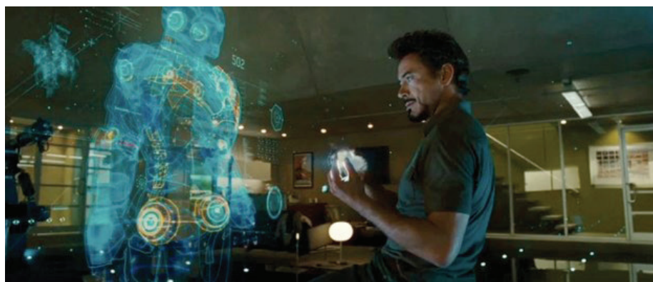
Figure 1. Tony Stark from Iron Man using mixed reality.

goals of the NDS to modernize, pursue new methods for acquisition by leveraging OTA agreements improve readiness, and increase the joint force's ability to compete. Mixed reality systems have a multitude of potential applications that can be used on the battlefield, in maintenance bays, aboard ships, in aircraft hangars, and in testing, modeling, and planning. It has the potential to change how the DOD wargames. Mixed reality systems, when partnered with Artificial Intelligence (AI), advanced peripherals, and edge computing will increase the lethality and effectiveness of the DOD service member wielding this technology. Using these advanced technologies, the DOD can bring Multi-Domain Op-