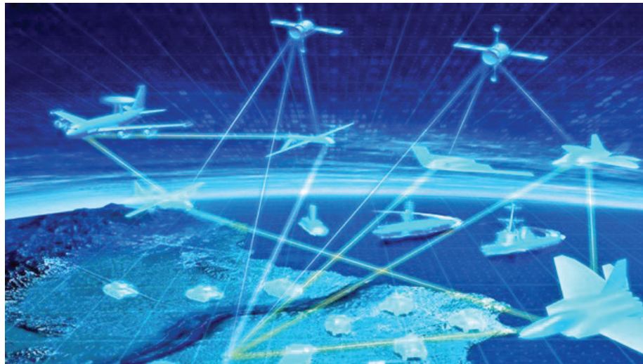
Figure 2. JADC2 concept.

Mixed reality brings together augmented reality, virtual reality, and the real world. Mixed reality allows the user to see the physical world while having digital content that enables interaction with real-world and virtual objects. 5 Mixed reality also allows the user to create and leave data in a data block accessible to other users. A soldier, for example, conducts a bridge reconnaissance and creates a data block containing the bridge report. A Marine wearing a mixed reality system leading a convoy would be able to see the data block as he approaches the bridge and open the report to determine if the bridge would support the vehicles that are in the con-