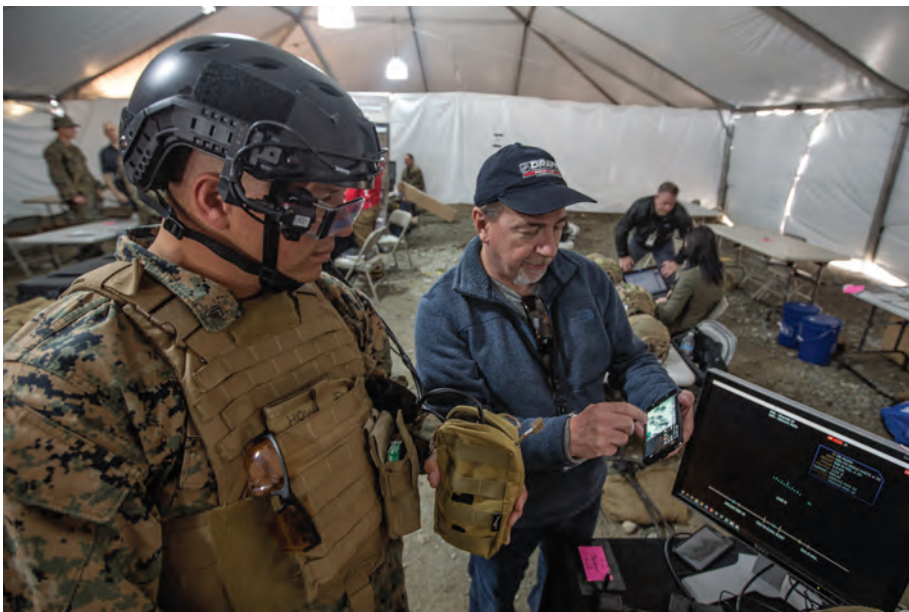
Are there items of equipment that can be procured for our Marines more rapidly and efficiently?

The Cyber OPT developed fifteen problem statements touching on all aspects of the acquisitions process and addressed people, process/policy, organization, requirements, funding, procurement, sustainment, and governance. During course of action development, we applied only one criterion: courses of action must address at least one problem statement, have a measurable impact, and comply with laws, regulations, and policy. By June 2015, the Cyber OPT provided 26 recommendations to expedite cyber acquisitions, and within those 26 recommendations, there are 40 tasks that broadly fall into two categories based on their scope of impact. There are ten cyber-specific tasks affecting MCSC cyber stakeholders, and there