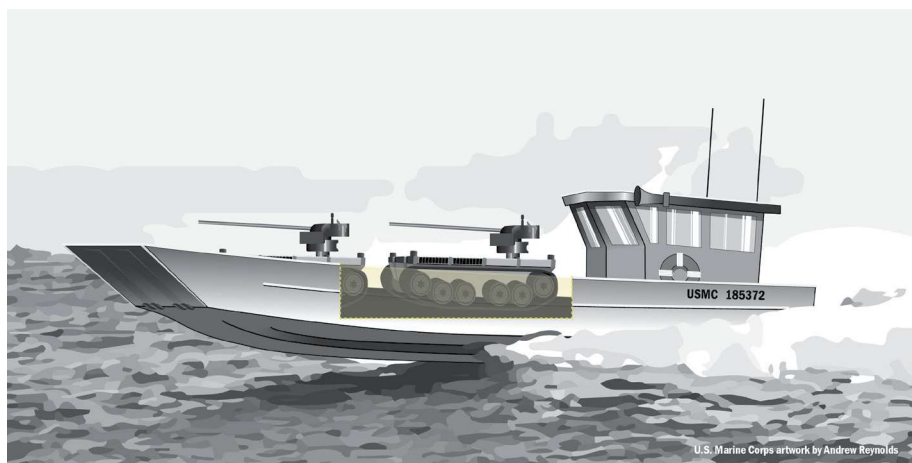
Figure 1. Artistic rendering of a Small High-Speed Amphibious Role-Variant Craft (SHARC) carrying two Expeditionary Modular Autonomous Vehicles (EMAV).