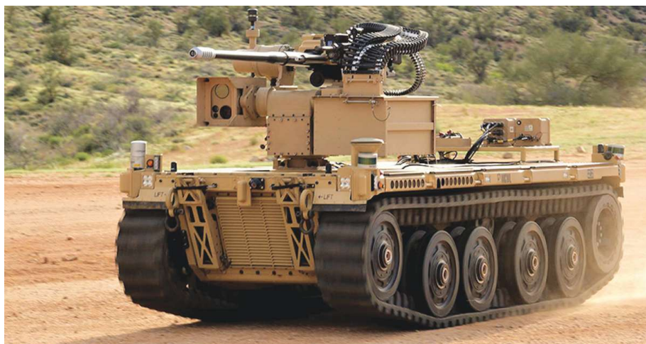
Figure 3. The EMAV is an unmanned ground vehicle developed by the MCWL, designed to host both commercial and government-owned MMPs.

Deployed units of the MLR would use the technologies of the MERICA System to conduct theater security cooperation operations and other bilateral exercises during contact layer activities. This will enable the SHARC and EMAV to be geographically pre-