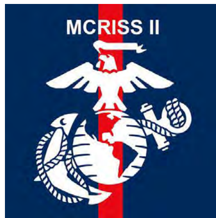
MCRISS II logo.

The remaining lower-level requirements were left to the new team for development. That team consisted of MCSC program management office personnel, MCRC Marines, and contractor support. With recruiters driving the identification and development of new system requirements, the team