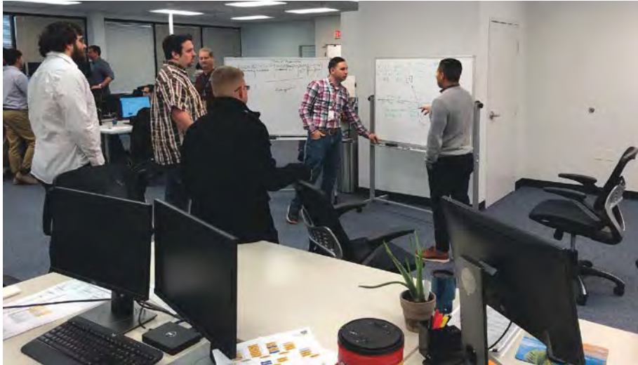
Recruiting expertise enabled the team to write forward requirements.

communication of recruiting system requirements while teaching the developers how the Corps uses the system to recruit its next generation of Marines. This relationship allowed the software experts to vet new design concepts with recruiters prior to implementation.