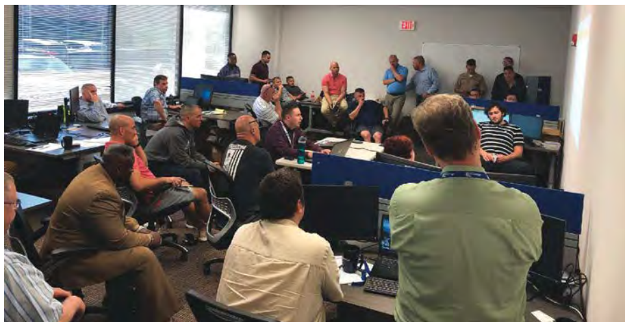
The system demonstration included interaction and group participation.