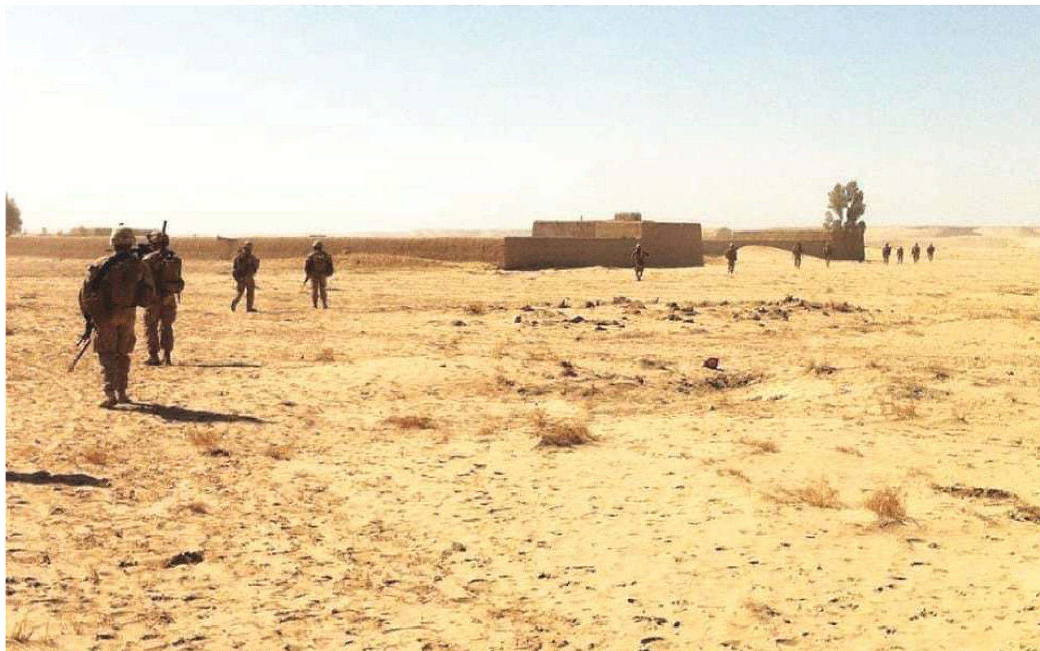
A squad from 1/9 conducts a patrol in Helmand Province in 2014.

"We need to talk about this ... I think we need to take a break."