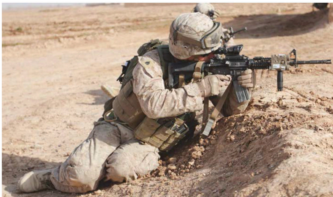
Below: A squad leader with 1st Bn, 9th Marine Regiment, provides security for Marines moving to the next compound during a patrol in Helmand Province, Afghanistan, Dec. 22, 2013.