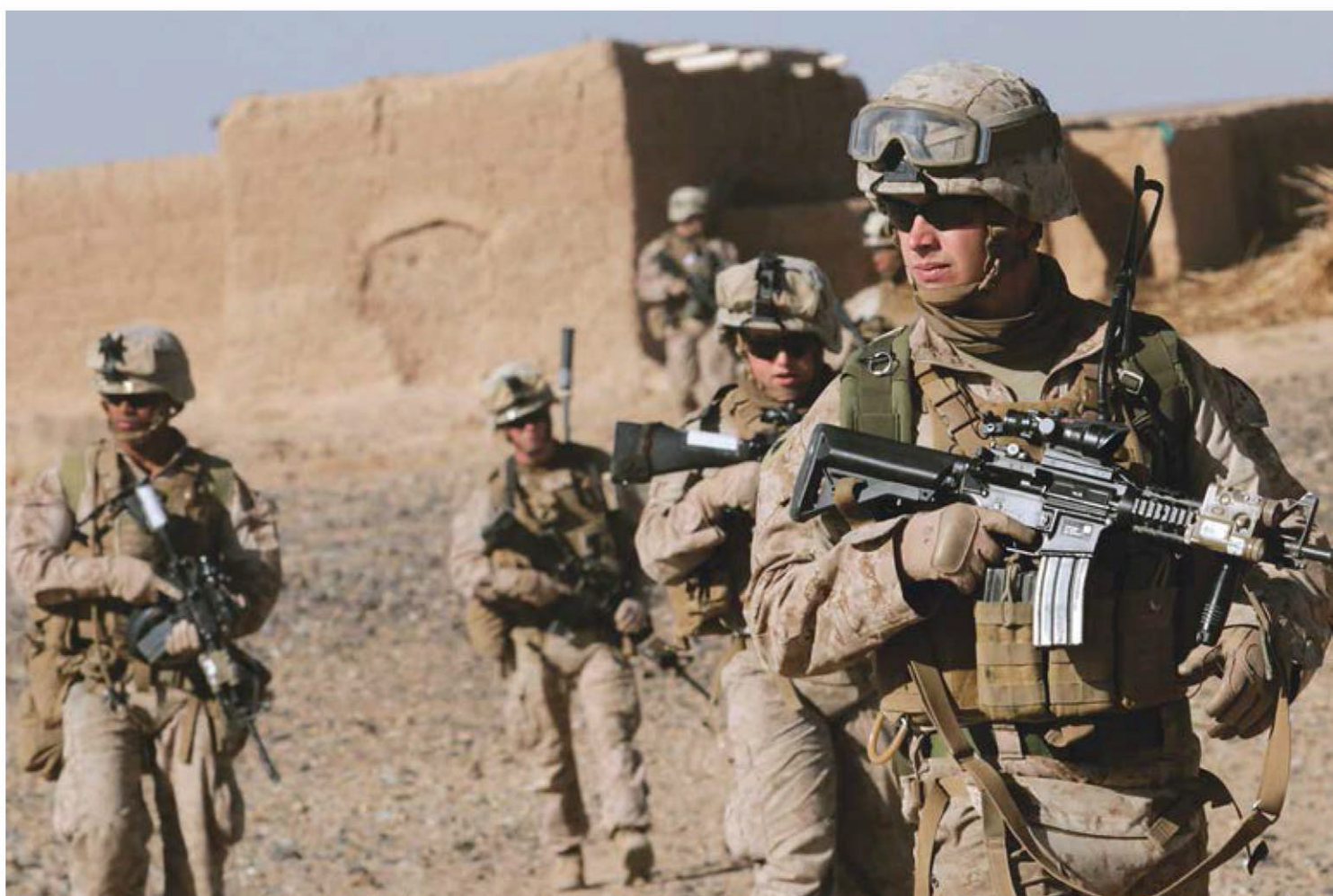
A squad leader in 1/9 leads his squad to the next compound while patrolling Helmand Province, Afghanistan, Dec. 19, 2013.