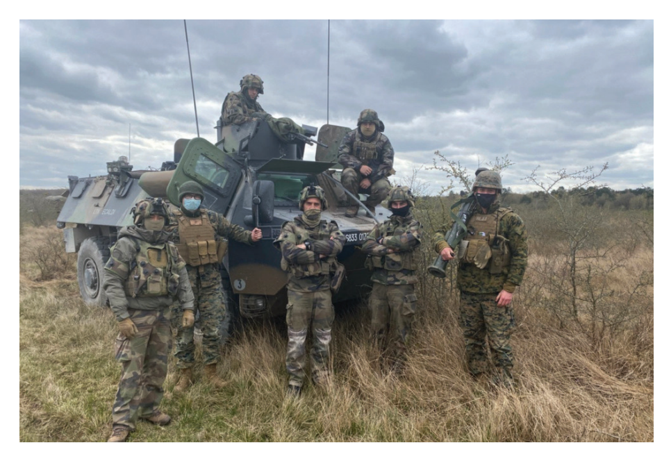
ANGLICO Marines routinely train with and operate alongside allied and partner-nation forces.

able to operate effectively or at worst, restricted drastically. A solution to this problem, which 2D MIG is currently doing, is through iterative campaigning with allies and partners who already have those authorities. Combining those authorities from each nation with our own fills in the gap required for successful operations on the modern battlefield.