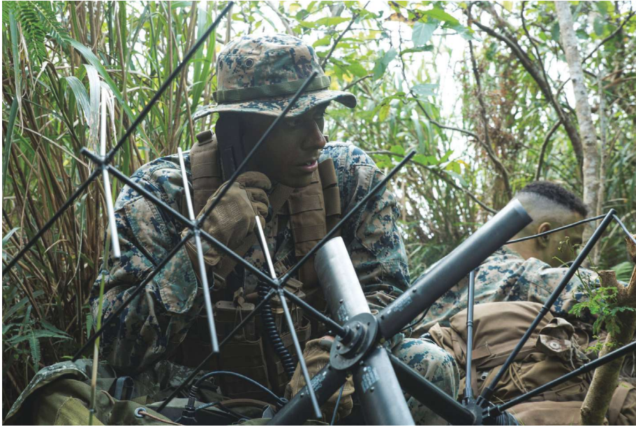
We have to be able to navigate through an increasingly complex environment to gather and process information.

cal population in the various hamlets and villages are aided by the Identity Dominance System—Marine Corps (IDS-MC).