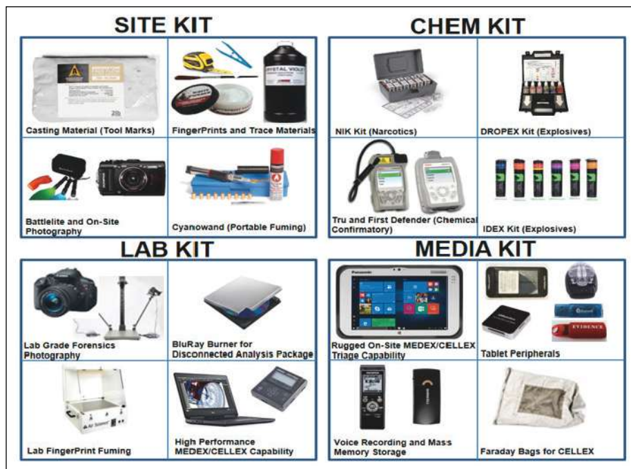
Various kits available for deployed forces to track and interact in the human terrain.

As construction of the IDP camps begins, Marines providing security at the sites and interfacing with the lo-