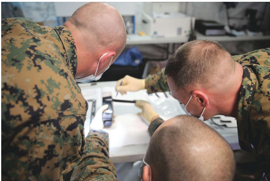
Marines conducting biometric exploitation.

local population in Kutown, no longer on the brink of starvation and being forced to turn over much of their food to their own military forces, becomes forthcoming with the identities of other militia leaders in villages where they have family and friends.