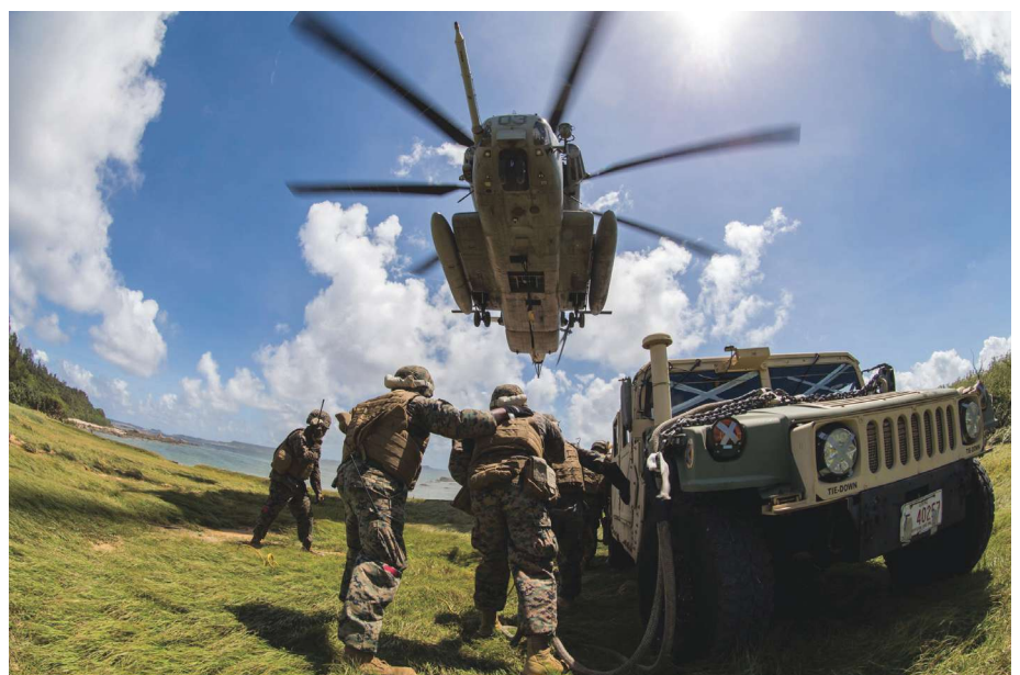
The ground training and readiness system is being completely revised.

The implementation framework also highlights the elevation of "train" as an equal function to "man" and "equip" to meet the Commandant's guidance of ensuring those functions are aligned and sufficient to the operating environment. The outputs of this framework are sim-