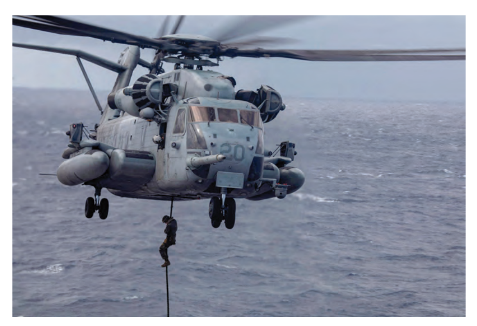
Marines pioneered large-scale employment of helicopters.