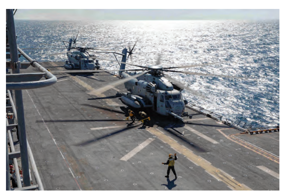
Marines and Navy leaders will need to be flexible as we re-examine Naval Service roles and missions.