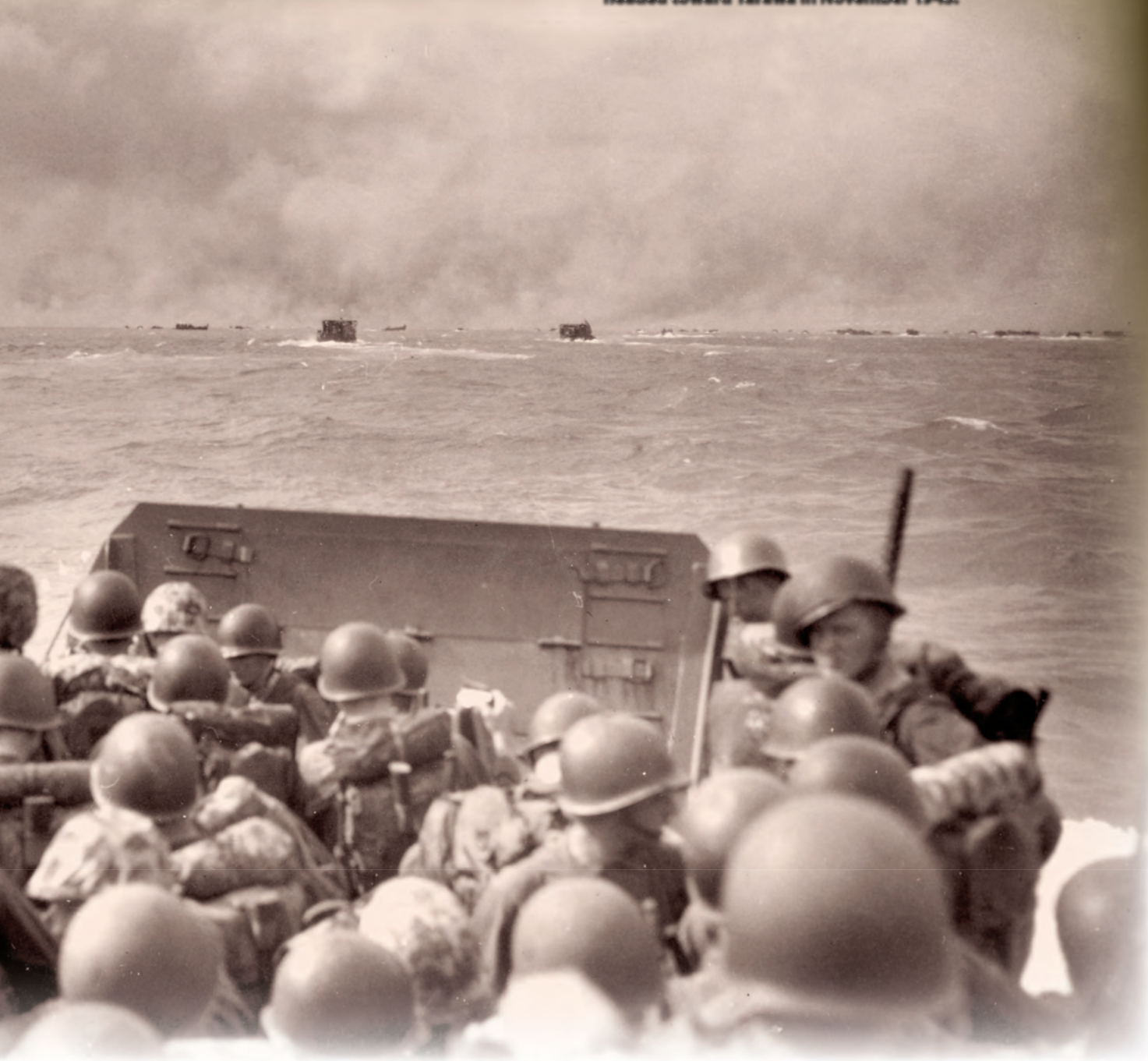
Marines crowded together in a Higgins boat headed toward Tarawa in November 1943.