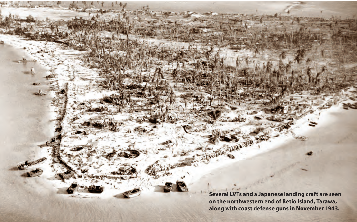
Several LVTs and a Japanese landing craft are seen on the northwestern end of Betio Island, Tarawa, along with coast defense guns in November 1943.