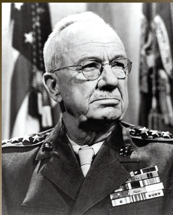
Gen Holland M. "Howlin' Mad" Smith