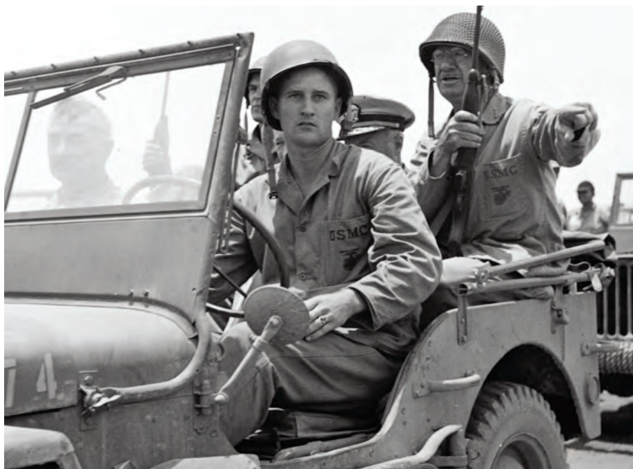
LtGen Holland M. Smith tours the area near the Saipan airport in August 1944.