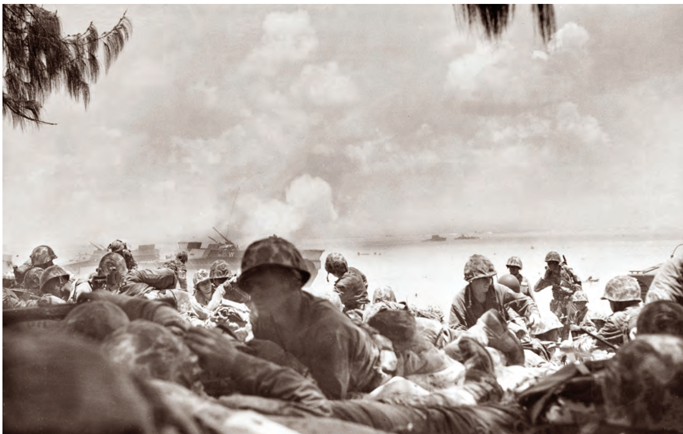
Marines from the first wave hug the beach on Saipan and prepare to move inland on D-day, June 15, 1944. Note the burning LVT in the background.