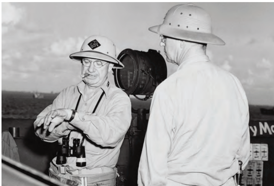
LtGen Holland M. Smith, left, aboard USS Rocky Mount (AGC-3) at H-hour on D-day off Saipan, June 15, 1944.