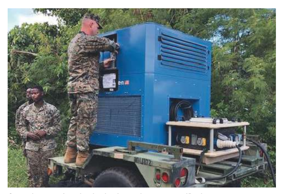
Generating water from the air takes longer than current purification systems.

Generating water from the air takes longer than current purification systems, which limits capabilities when expedient bulk water is required. AWGs