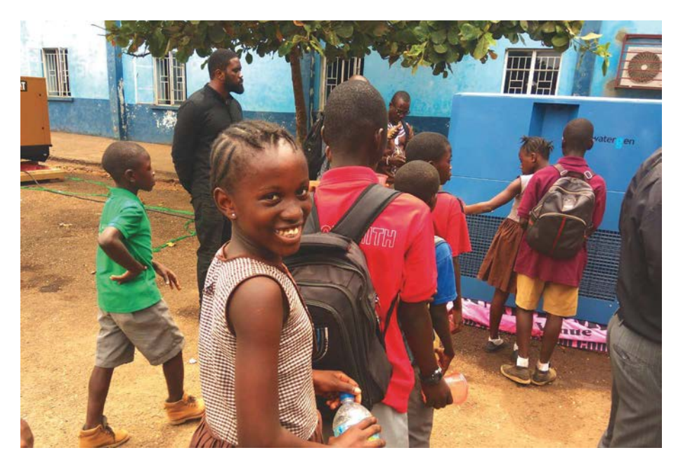
Villagers in Sierra Leone line up to get water from a Watergen USA.

I2Fs are an effective way to keep up with the exponential growth of technology by coupling a subject matter expert from the Fleet Marine Force with a reputable company willing to host, teach, mentor and share applications of capabilities. This pairing should provide strategic outcomes to both parties to ensure the maximization of time and