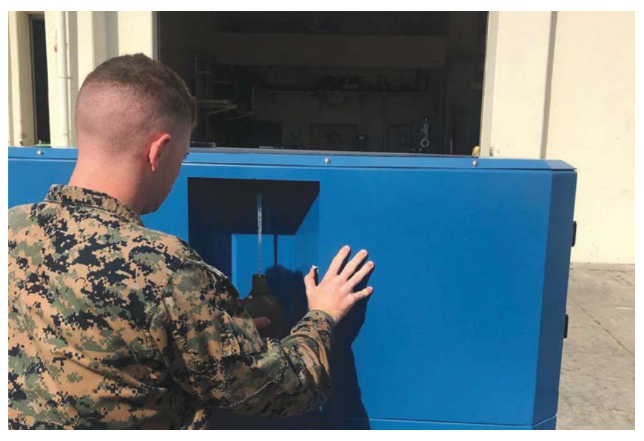
AWGs can support sustainability for distributed operations, provide sustainability in crisis response, and possibly mitigate future conflicts.

The luxury of large-scale logistics buildups is unsupportable in a fight with a peer competitor. Currently, Marine