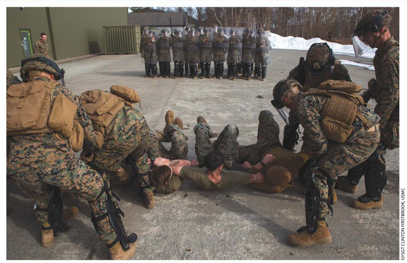
Training in riot control, the use of nonlethal weapons and dealing with civil unrest is regularly included prior to deployments today. A platoon sergeant with Marine Rotational Force-Europe 18.1 analyzes response techniques during non-lethal training at Vaernes Garnison, Norway, April 3, 2018.

ficer of the Center for Law and Military Policy, a nonprofit think tank based in Southern California, said in terms of the 1992 riots, "we didn't get to the point where we went from enforcing the law in terms of civil unrest to the point of an insurrection where then we are able to tap into the authorities of the Insurrection Act.