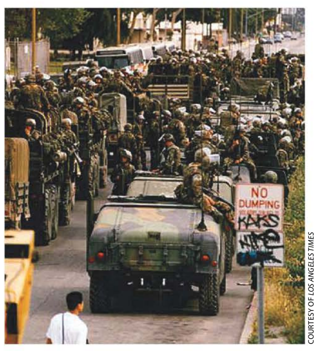
Marines at a staging area at Alameda and Elm Streets in Compton, May 3, 1992.

One instance that has become a cautionary tale about federal troops working