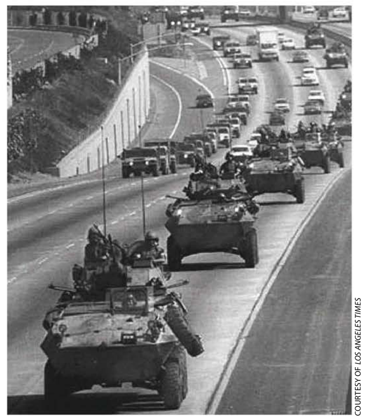
A convoy of Marines from MCB Camp Pendleton moves up I-5 on May 1, 1992.