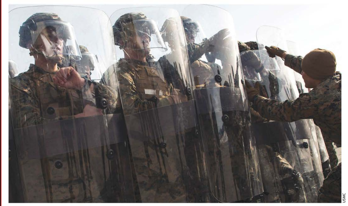
U.S. Marines in riot gear build a human wall during a riot control class as part of Exercise Cooperative Osprey '98 at Marine Corps Base, Camp Lejeune, N.C., on June 4, 1998. Marines from 3/1 and 1st LAR received similar training only the day before they responded to the Los Angeles riots in 1992.