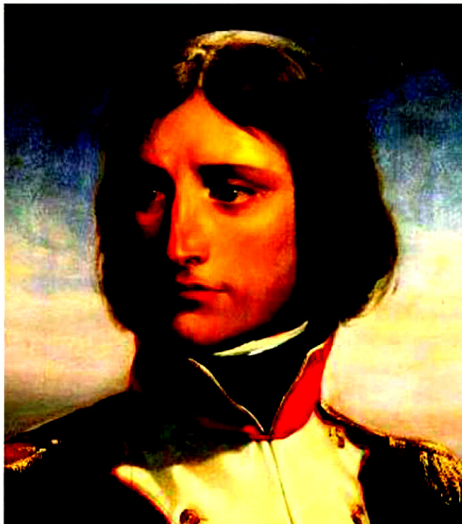
Napoleon Bonaparte, aged 23, lieutenant colonel of a battalion of Corsican Republican volunteers. (Painting by Henri Felix Emmanuel Philippoteaux, 1834.)