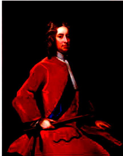
The Duke of Marlborough, 1716/17. (Painting by Enoch Seeman, 1716.)