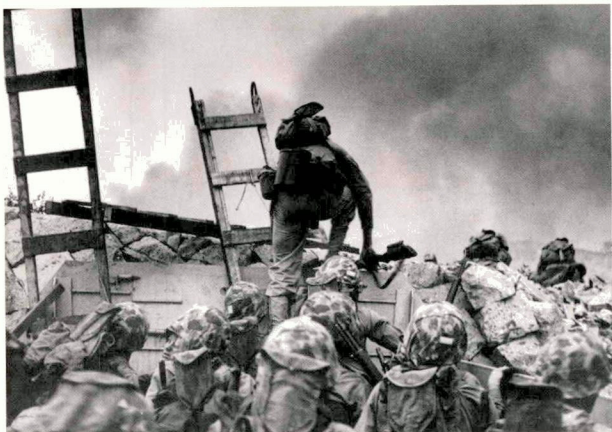
Above: First Lt Baldomero Lopez, platoon leader, Co A, 1st Bn, 5th Marines, scales the seawall at Inchon's Red Beach on 15 Sept. 1950. Shortly after this photograph was taken, Lopez sacrificed his life for his men, earning the Medal of Honor.

The plan hinged on three considerations: two were highly promising, while the third held disturbing elements. The