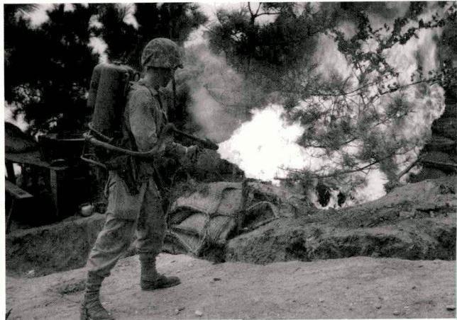
Below: This 3/5 leatherneck uses his flamethrower to burn out the enemy on Wolmi-do.