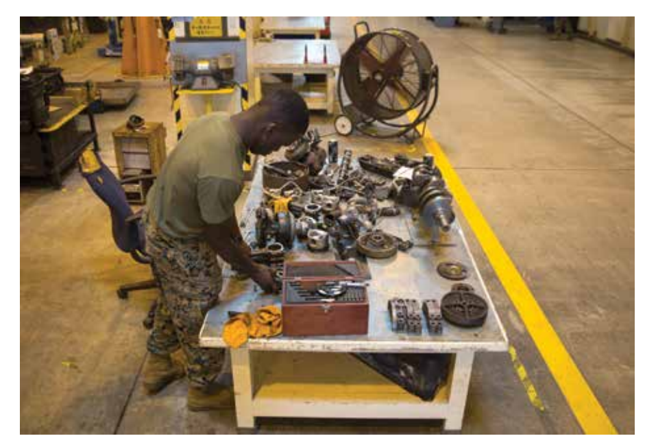
Effective maintenance management requires complete information based on reliable data.