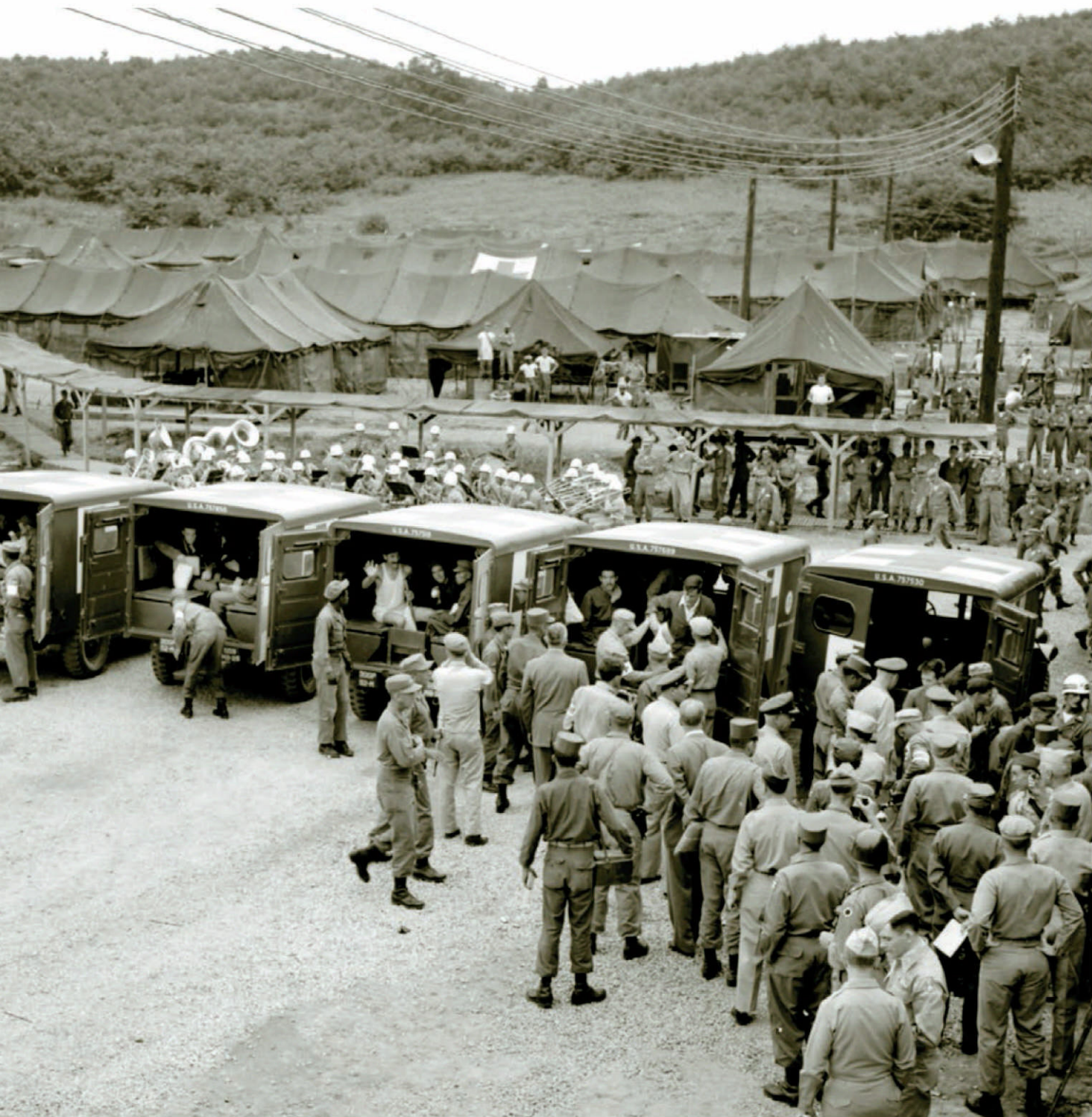
TSGT ROLANDE, ARMSTRONG, USMC

front lines; it continued in the prison camps where brave men matched their wills with those of their enemy.