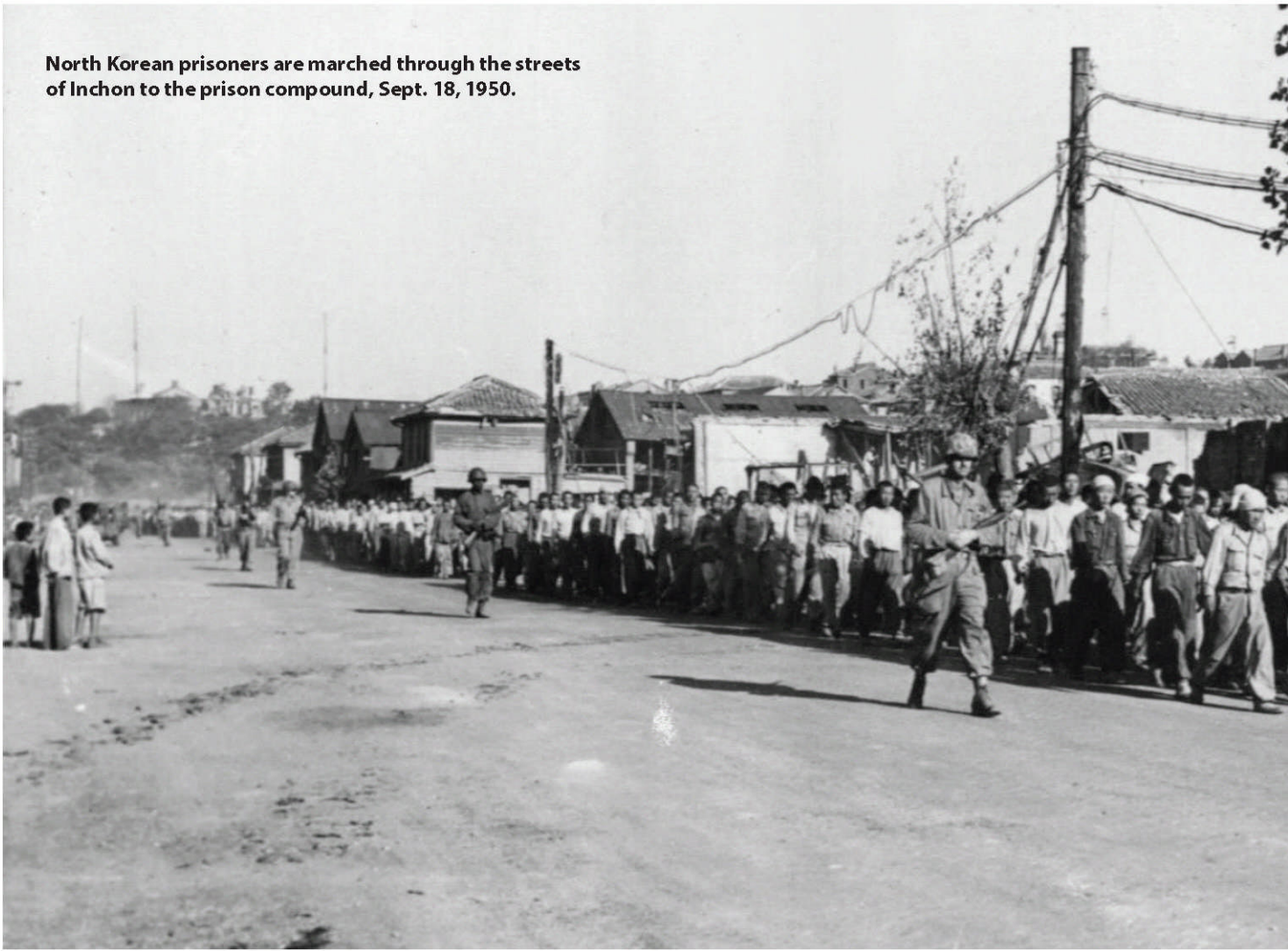
North Korean prisoners are marched through the streets of Inchon to the prison compound, Sept. 18, 1950.

opportunity to escape. It is doctrinally accepted that the best chance for escape is as soon after capture as possible. This tenet was borne out by Marines who had the misfortune of being taken prisoner in Korea. With one exception, the only successful escapes were those made in the first days or weeks after capture. If a prisoner was going to get away, he had better do it quickly.