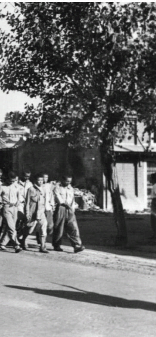
MARINE CORPS ARCHIVES & SPECIAL COLLECTIONS

Indoctrination and interrogation went hand in hand, one often masking the other in an all-out assault on the senses until the prisoner's mind reeled under the constant drumbeat. Prisoners were graded and classified as "progressive," those who at least appeared cooperative, or "reactionary," those who resisted.