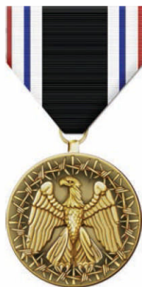
Prisoner of War Medal